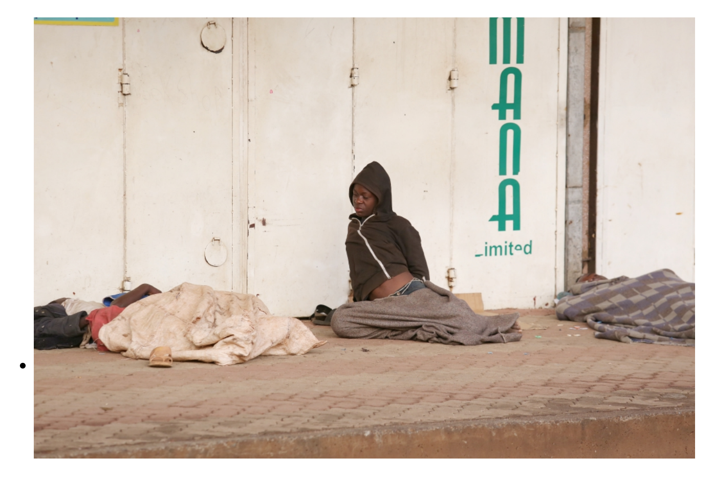
Street children begin to wake up at 6 a.m. to work at menial jobs and eke out a living. (Doreen Ajiambo)