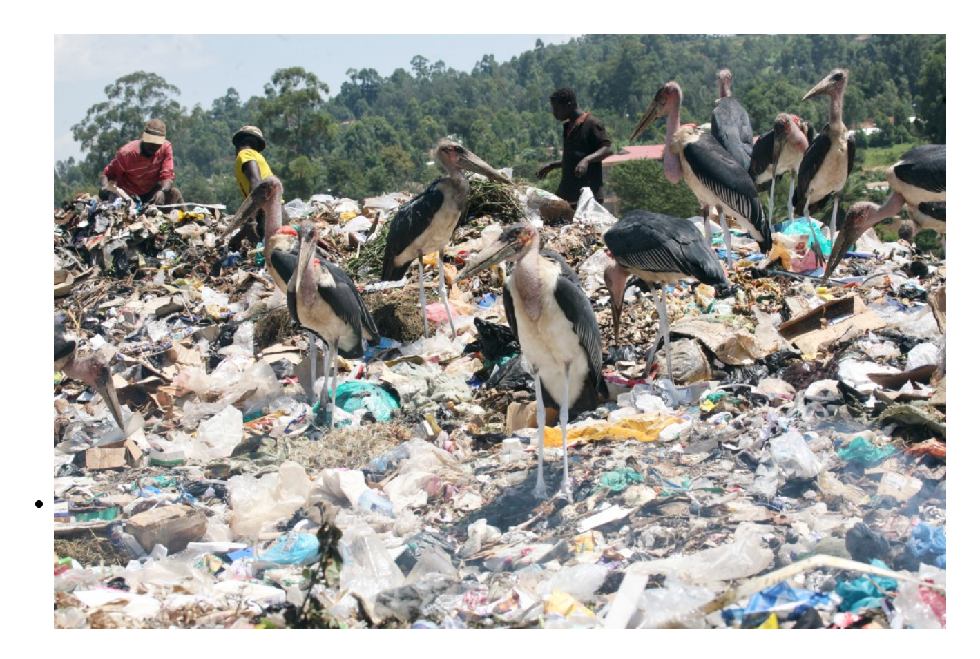
Homeless children compete with scavenger birds to comb the dumpsite for food. (Doreen Ajiambo)