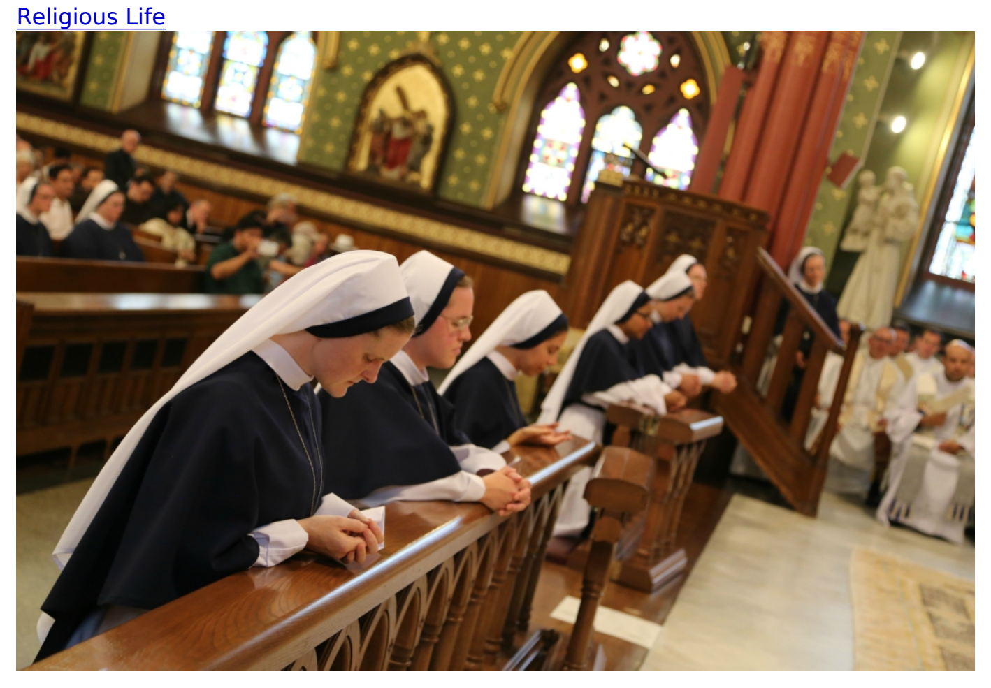
Sisters of Life pray at Mass.