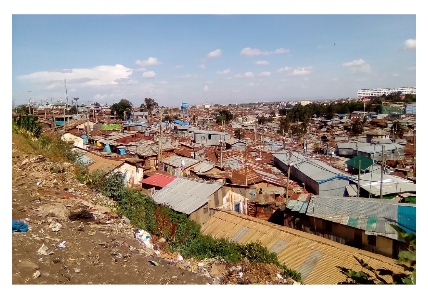
Kiswahlii district of Kibera slum settlement outside of Nairobi, Kenya, undated photo

Most Kibera slum residents live in extreme poverty, earning less than $1 per day. The slum has more than 1 million inhabitants who lack access to basic services like electricity, running water and medical care. Nearly all houses here are wooden shacks with a mud floor and a tin roof — no toilets or running water.