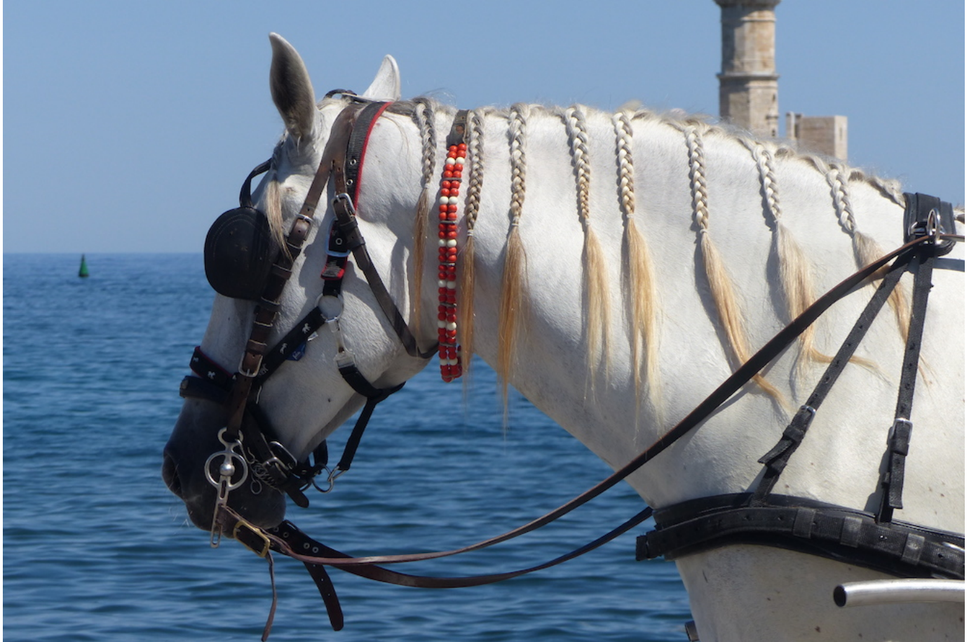
Carriage horse on old harbor of Chania, Crete, 2017