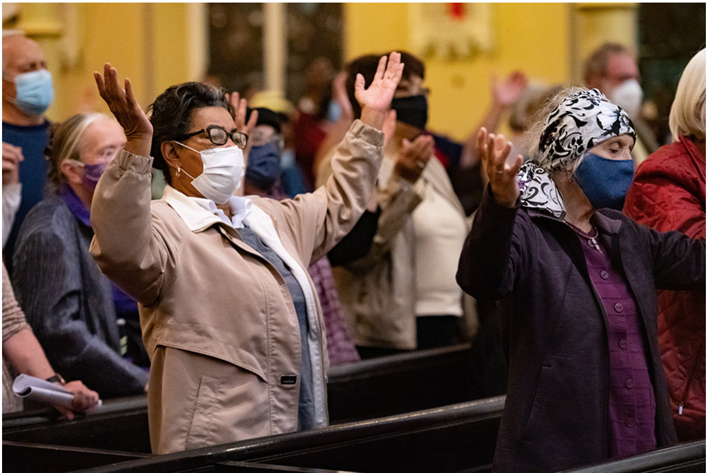
People in Baltimore attend All Saints' Day Mass at St. Ann Church Nov. 1.