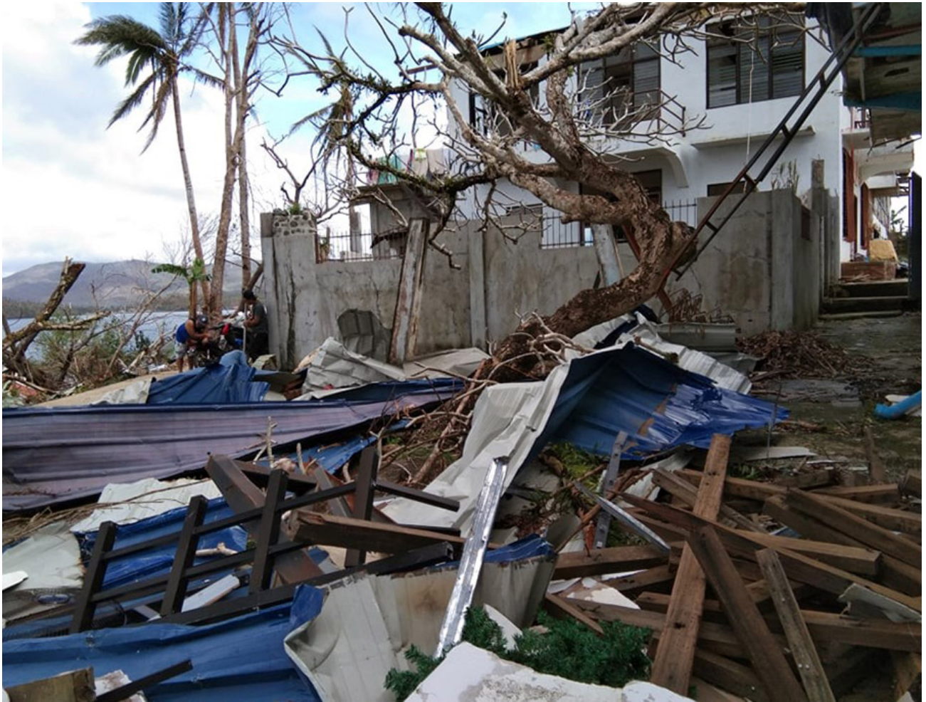
The rubble of the church's roof of San Isidro Labrador Parish in the town of Loreto on the Dinagat Islands, in the Philippines.