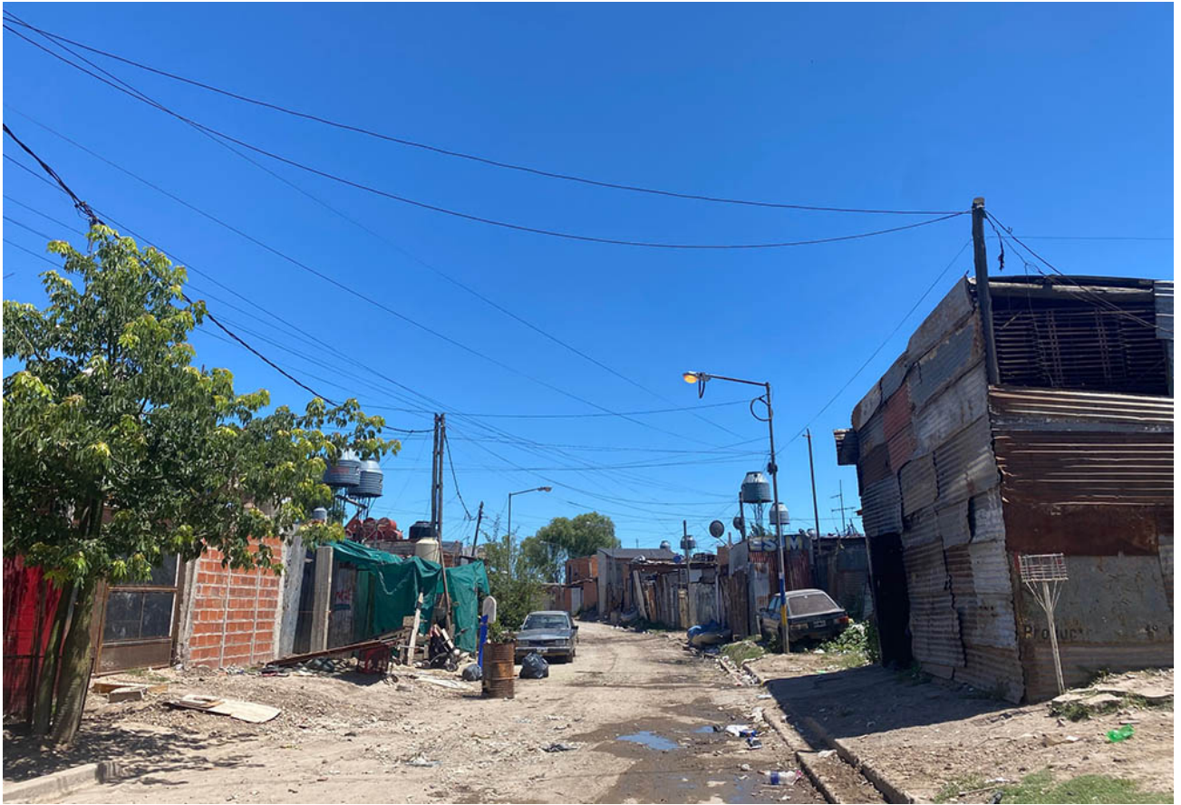
One of the main roads running through Villa Hidalgo, Buenos Aires, Argentina