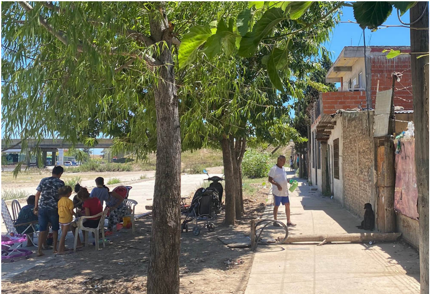
A family gathers outside their home in Villa Hidalgo, Buenos Aires, Argentina, on a late summer morning in January.