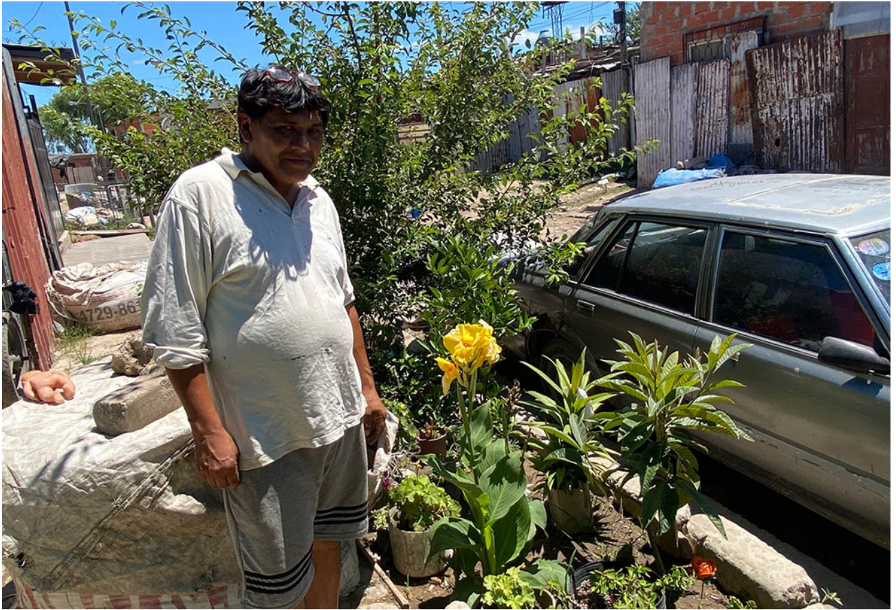
A man adds color to Villa Hidalgo with his garden in front of his home.