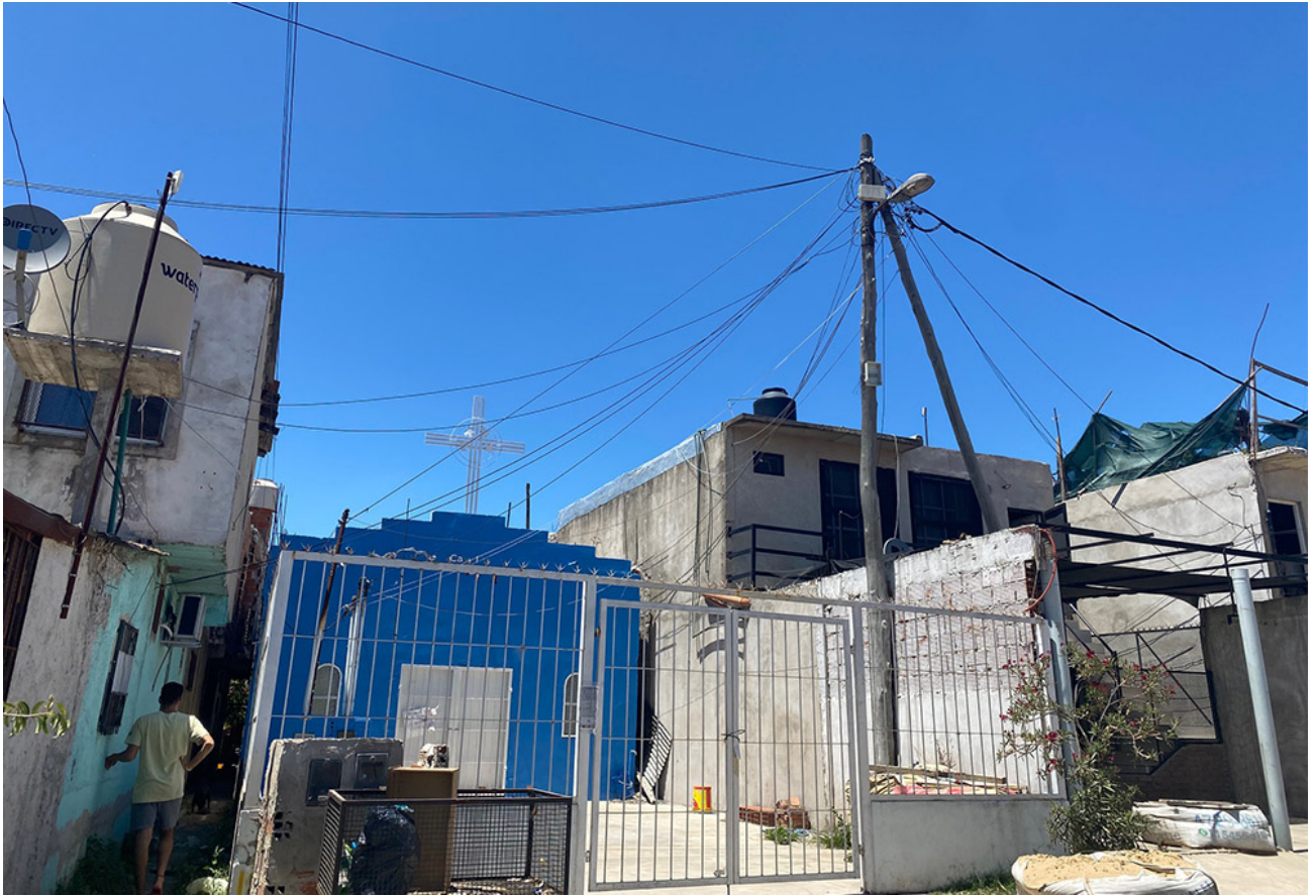
Outside Caacupé Chapel in Villa Hidalgo, Buenos Aires, Argentina