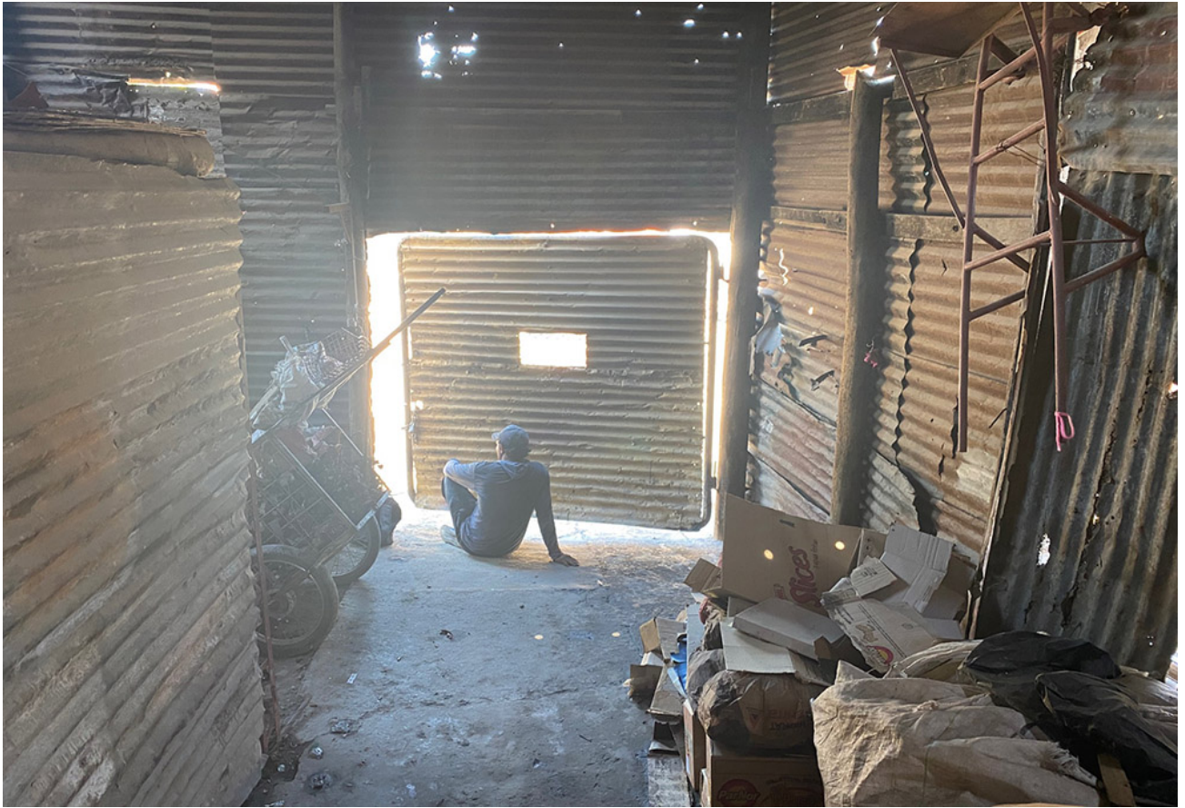
A man looks out the front door of his home. Beside him is a cart that cartoneros use to collect cardboard and other materials to trade for small sums of money.