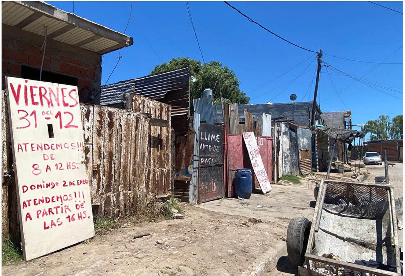
A street in Villa Hidalgo

Barreto agreed, saying most people "get involved in drugs out of necessity and from a place of pain."