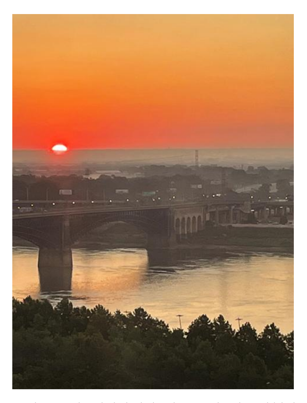
Sunrise over the Mississippi River in St. Louis, Missouri (Linda Buck)

I actually try not to use light and dark because it indicates a judgment that something light or white is good and that something dark or black is bad. Rather, I try to speak about wholeness and unfreedoms. What are unfreedoms in my life which hold me back from living the Gospel message authentically? Where are the places in my life that allow me to be expansive, whole, and creatively live God's call? The unfreedoms may be held within my own person, like beliefs and attitudes or wounds of the past. They may also be systemic, such as structural oppression or lack of resources. I am very aware that I have many more freedoms than my sisters