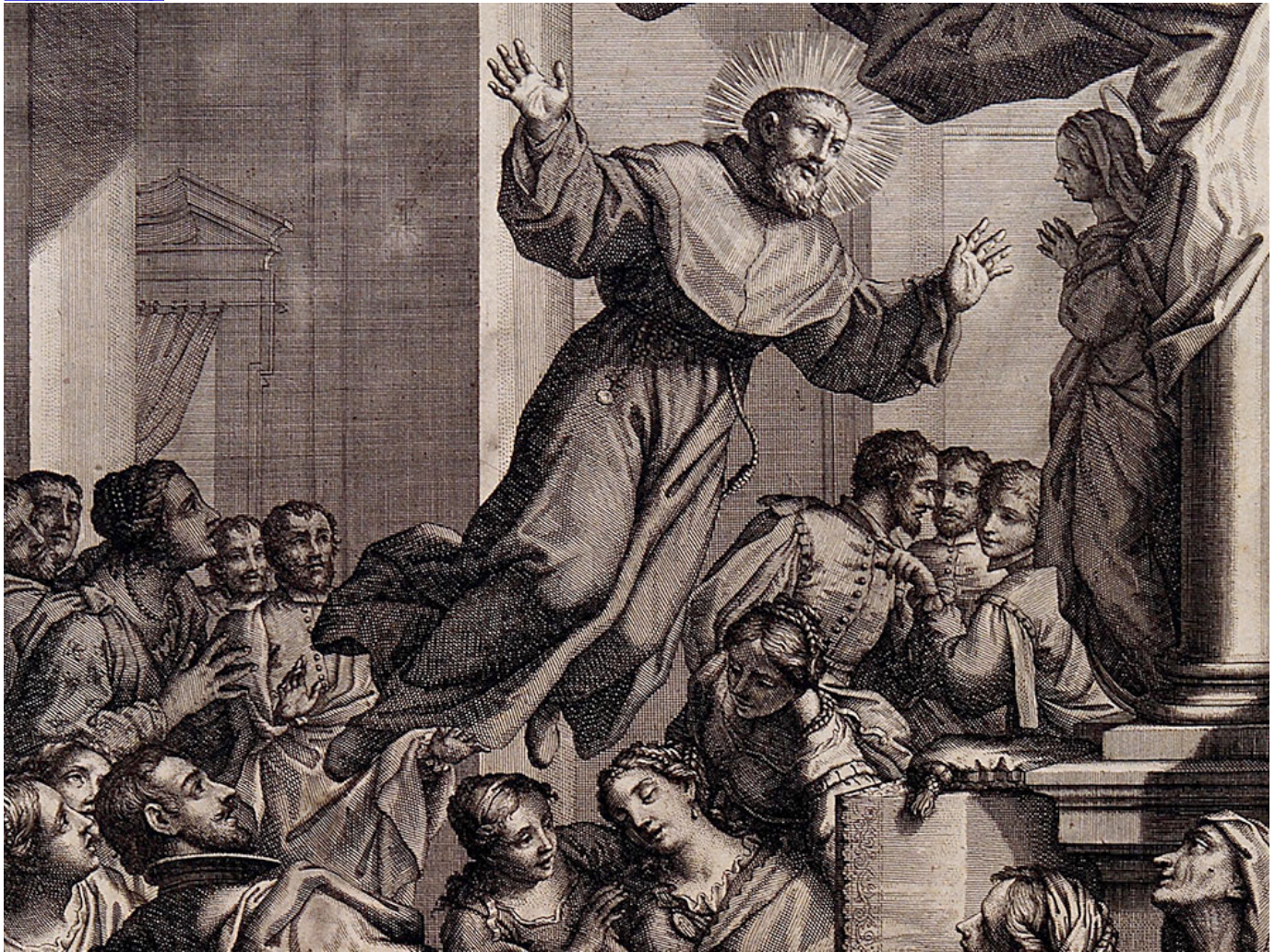
St. Joseph of Cupertino is depicted levitating in an 18th-century engraving by G.A. Lorenzini.