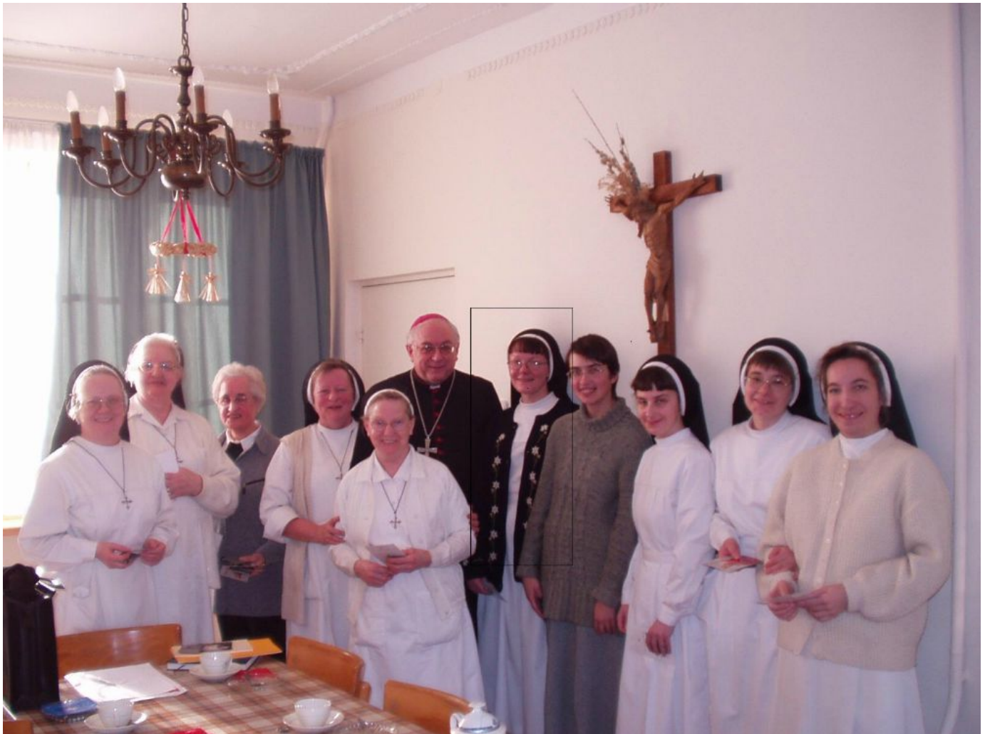
Bethany Dominican community pictured in Riga, Latvia, in 2003

Our charism was also transported to America: One woman who entered and left became the foundress of a Bethany community in a Norfolk, Massachusetts, prison for men. As a lay woman, she was assigned as chaplain to the prison by the bishop of Boston. Her message of God's mercy and love ignited a fire of devotion that led prisoners to form a community of prayer. In 1999, the Master of the Dominican Order, Timothy Radcliffe welcomed them into the Third Order of Dominicans. The prison administration provides them with a chapel where they celebrate liturgy of prayer and Eucharist. One of the brothers said: "... Bethany community is nothing more or less than a miracle... ."