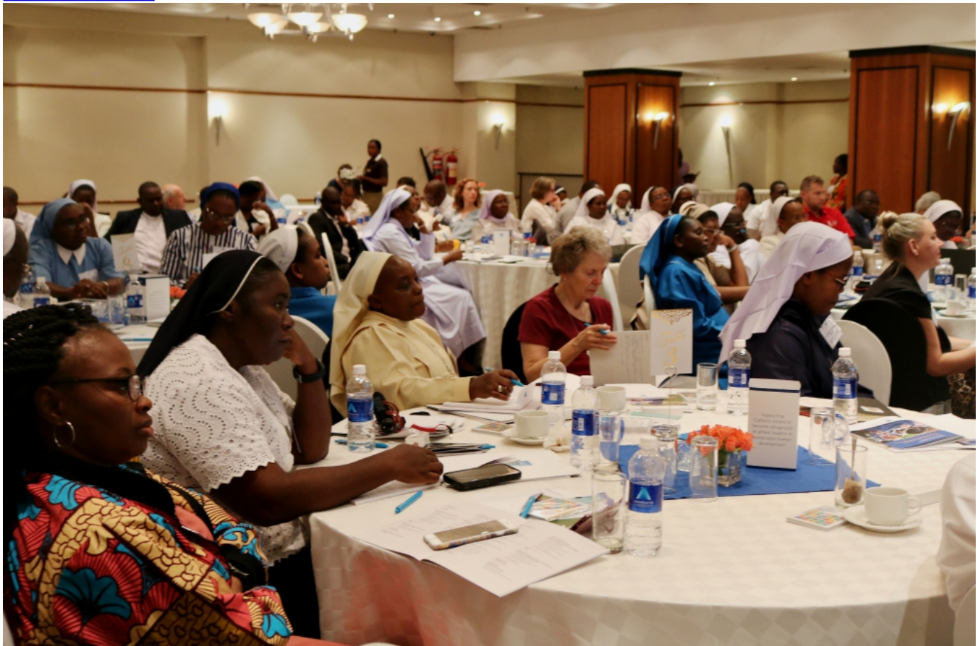
Catholic sisters, partners and grantees attend sessions during the Conrad N. Hilton Foundation's Oct. 23-25 convening in Lusaka, Zambia.