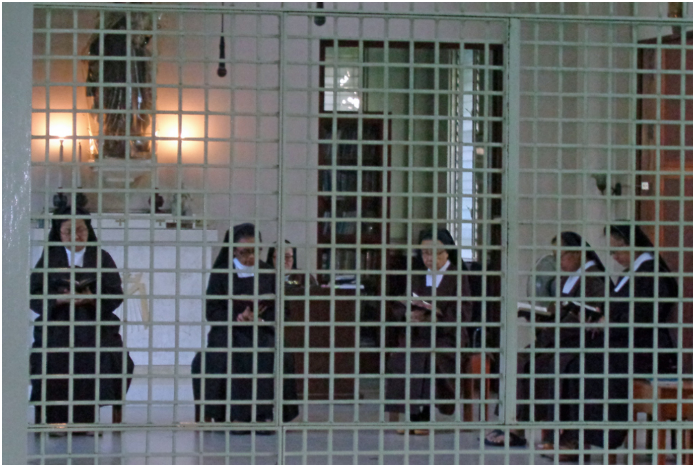
The Carmelite nuns chant the mid-morning prayers of the Liturgy of the Hours.

Seven times each day, the community gathers to either celebrate the Eucharist or chant the Liturgy of the Hours. Each nun then has two hours a day scheduled for silent prayer, "but the spirit of prayer overflows into the hours of readings, study, work and recreation." A Carmelite usually stays in her room to pray and meditate on the Word of God, unless she has other duties.