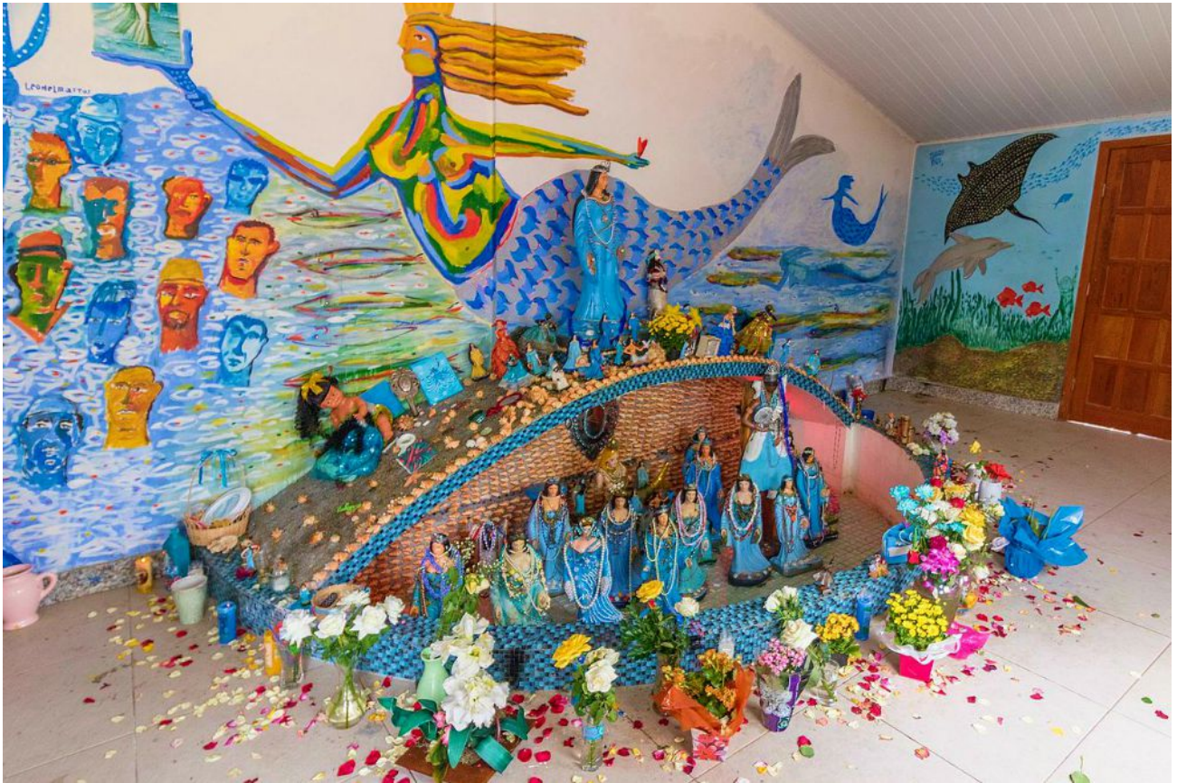
An altar of Casa de Yemanjá, Rio Vermelho, Salvador, Bahia, Brazil

among the parishioners, the final blessing given and then — Then a whole new celebration began!