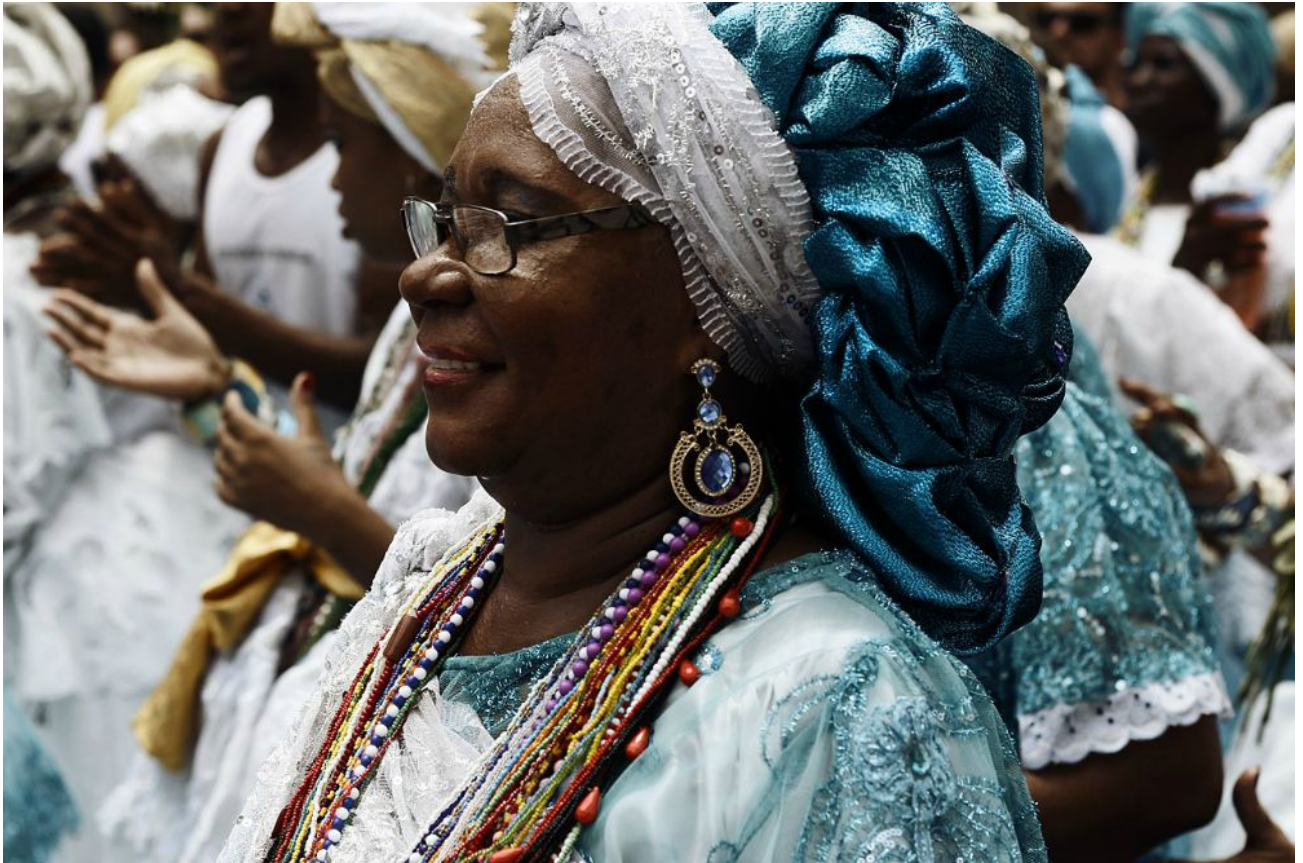
People gathered in Salvador, Brazil, in honor of Yemanjá, the sea