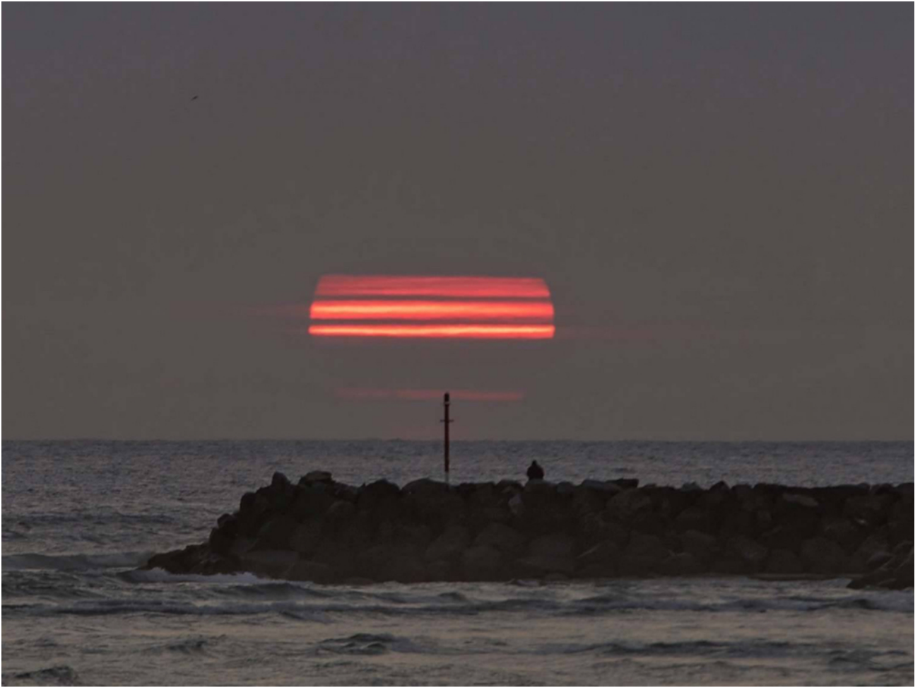
The sphere of the rising sun off the coast of New South Wales is only partially visible amid smoke from Australia's bush fires. (Bryan Ricketts)