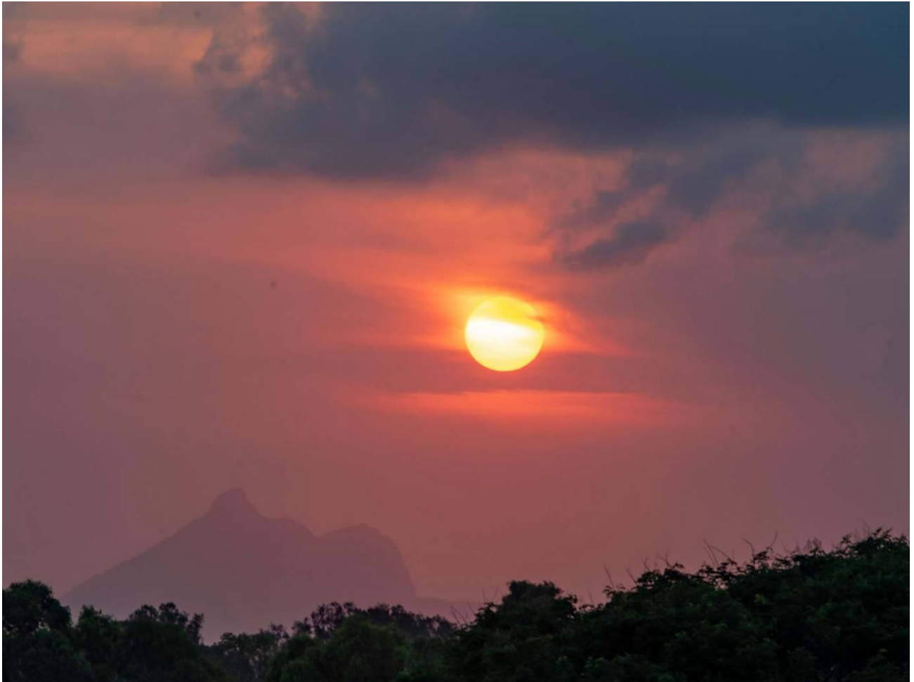
The setting sun is obscured by smoke from bush fires in New South Wales, Australia. (Bryan Ricketts)