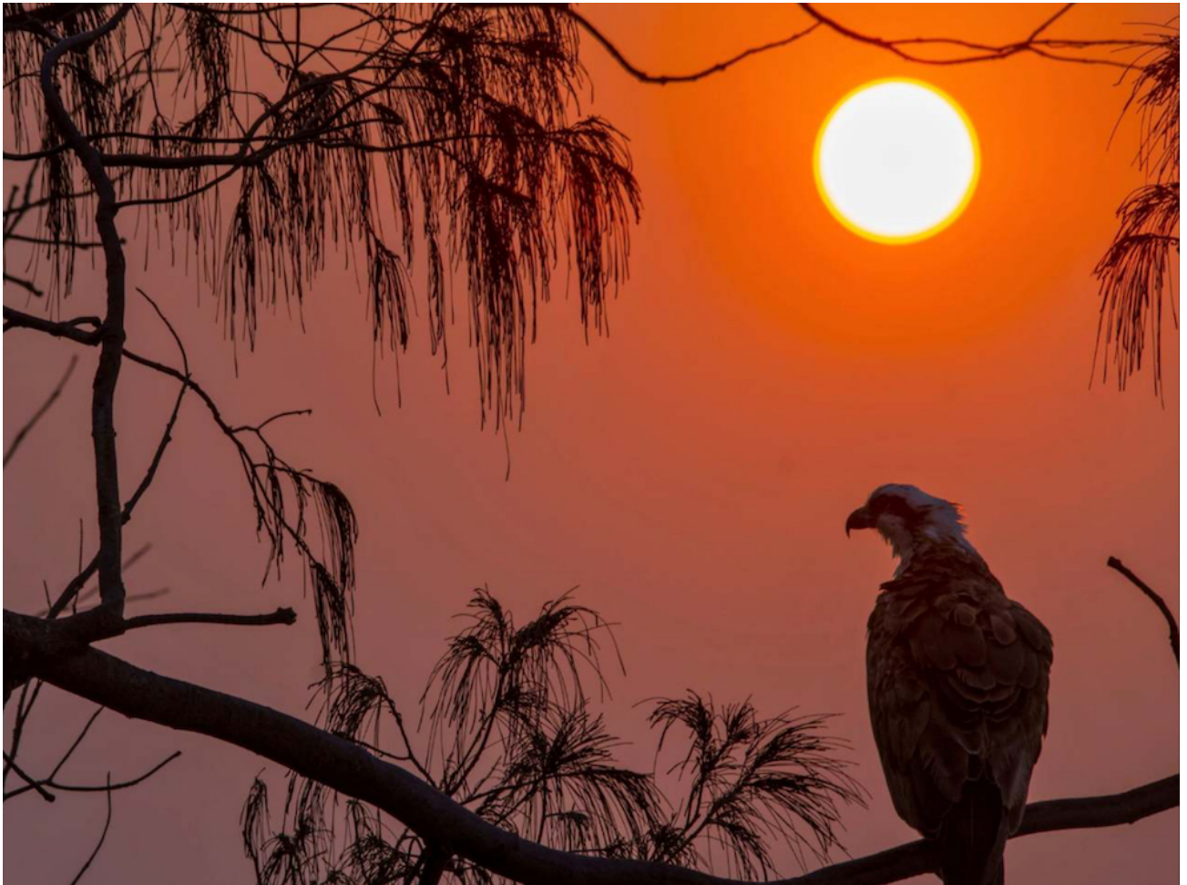
An osprey is seen against the smoke-filled sky at sunrise near Kingscliff, New South Wales, Australia.

We have been deeply moved by our courageous firefighters, putting their lives on the line, and have been saddened that some have died in doing so. In unprecedented evacuations, families have had to flee, taking shelter in designated centers or on beaches, often not knowing if their homes have been saved. Whole townships have been burnt. In some places, water systems, electricity and telecommunications have failed.