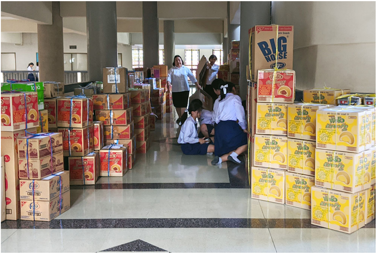
Eighth-grade Mater Dei students prepare supplies for a weekend trip to visit refugee students at a sister school on the Cambodian border.