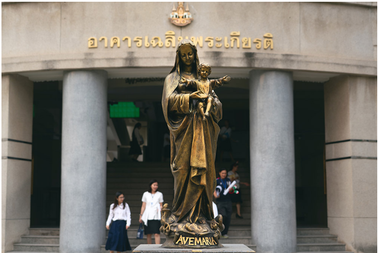
Teachers leave for the winter holiday past an Ave Maria statue at the entrance to the Mater Dei classrooms.