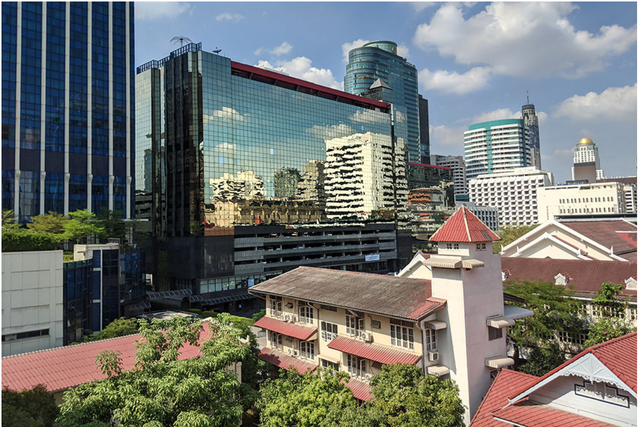
An older section of the Mater Dei campus first developed in 1927 sits below Bangkok skyscrapers.