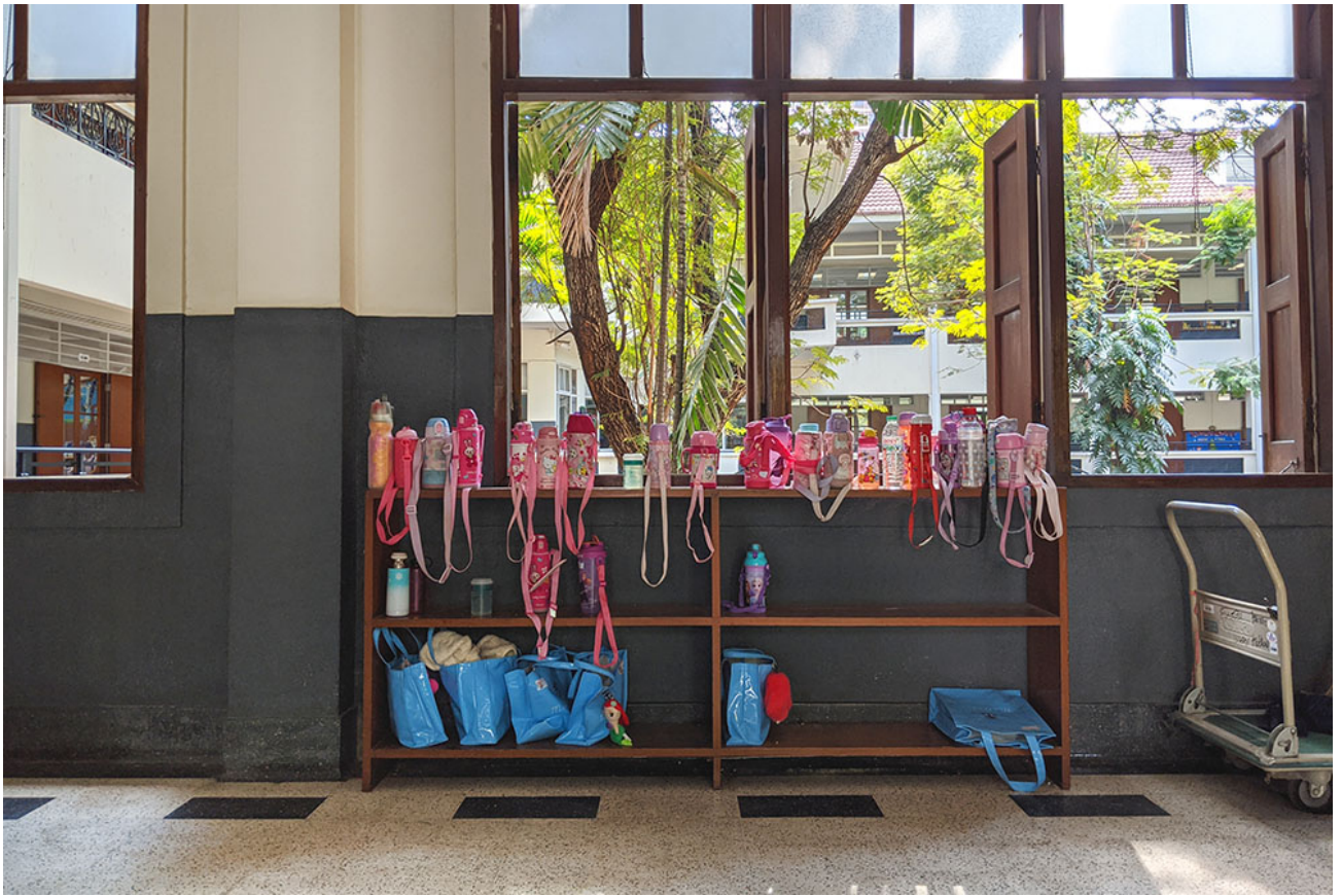
Mater Dei elementary students' homemade lunches sit on a stairway landing.