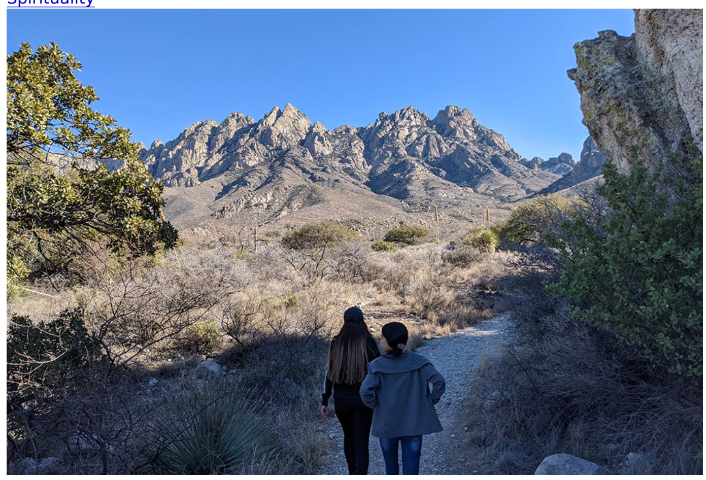
The Organ Mountains in Las Cruces, New Mexico