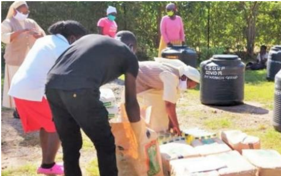
Little Sisters of St. Francis serve in solidarity with the poor and needy during the COVID-19 pandemic.

These practices have resulted in an increasing desire among the sisters for personal and institutional renewal. Members have become more vibrant in their apostolates. There is desire for specific growth practices such as special retreats, workshops (e.g., about family trees), Franciscanism and knowledge of Mariology.