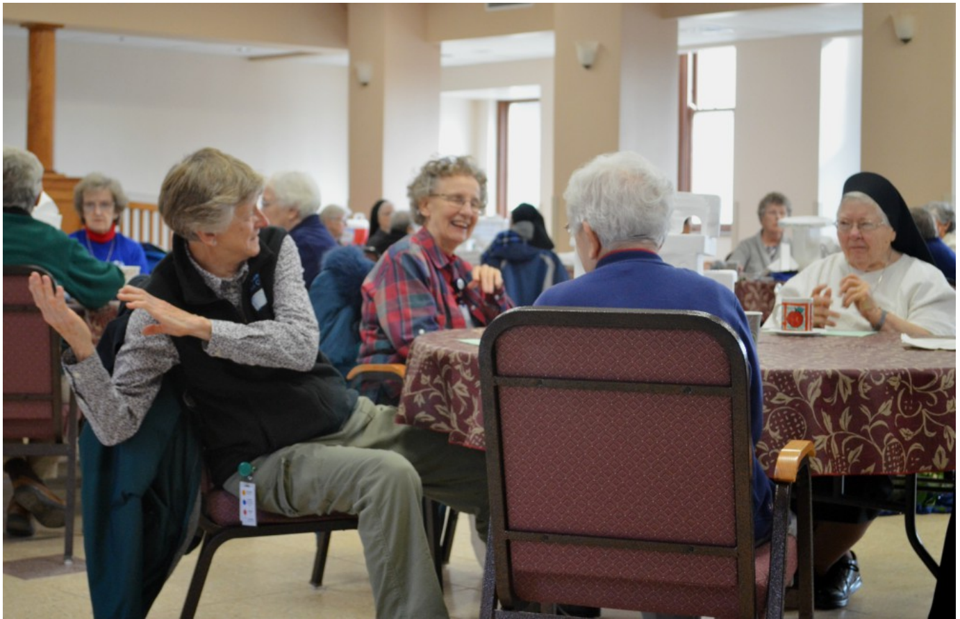
Members of the Poor Handmaids of Jesus Christ converse during a retreat on community-building.

One of the definitions we adopted for contemplative dialogue was: "It is a way of being together, a way of engaging in meaningful conversations that are rooted in deep listening. We listen from an inner silence that creates a space where something new can emerge."