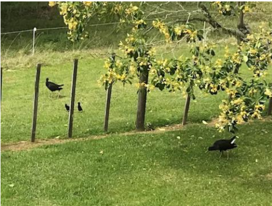
Two parent pukeko (the Maori name), or Australasian swamp hens, and their two chicks forage for food.

There are many others, but what these have in common is that they nest on the ground. So, in order to avoid predatory hawks in the skies above and rapacious stoats and rats on the ground, the chicks have to be up and about within a day of hatching.