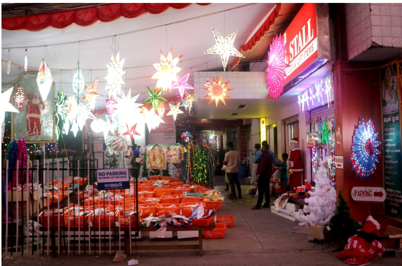
Deserted Christmas stalls are seen in Thiruvananthapuram, India, Dec. 11, 2016.