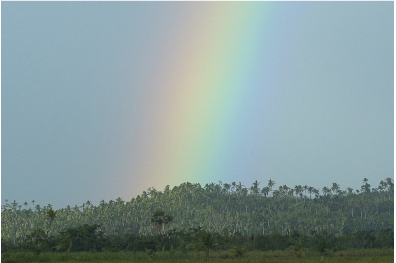
Rainbow near Basey, Philippines, 2014