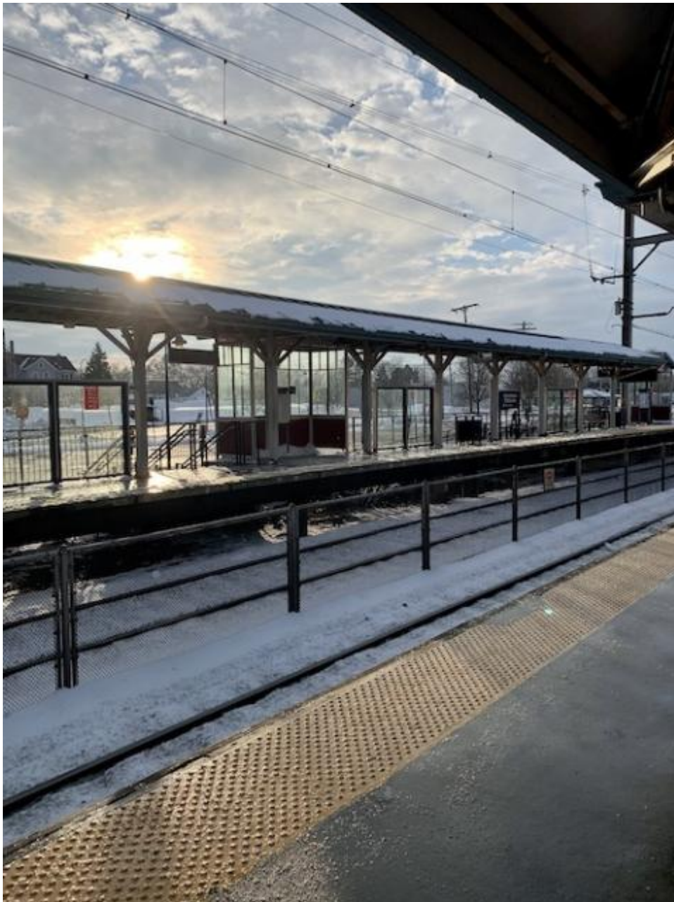
A view of the sun after days of heavy snow, taken from the train tracks nearest to Collier High School in Wickatunk, New Jersey

My service year so far at Collier High School has been filled with nothing but the unexpected. I have built and sustained community with other Good Shepherd Volunteers over the phone, via group texts, and through monthly virtual gatherings. I have embraced the beauty of the rural land and forest that Collier sits on by hiking, biking and exploring its trails. I have laughed, shared meals, and supported my alma mater by watching Notre Dame football games with the Sisters of the Good Shepherd. I have aided with a career assessment course when I myself am still