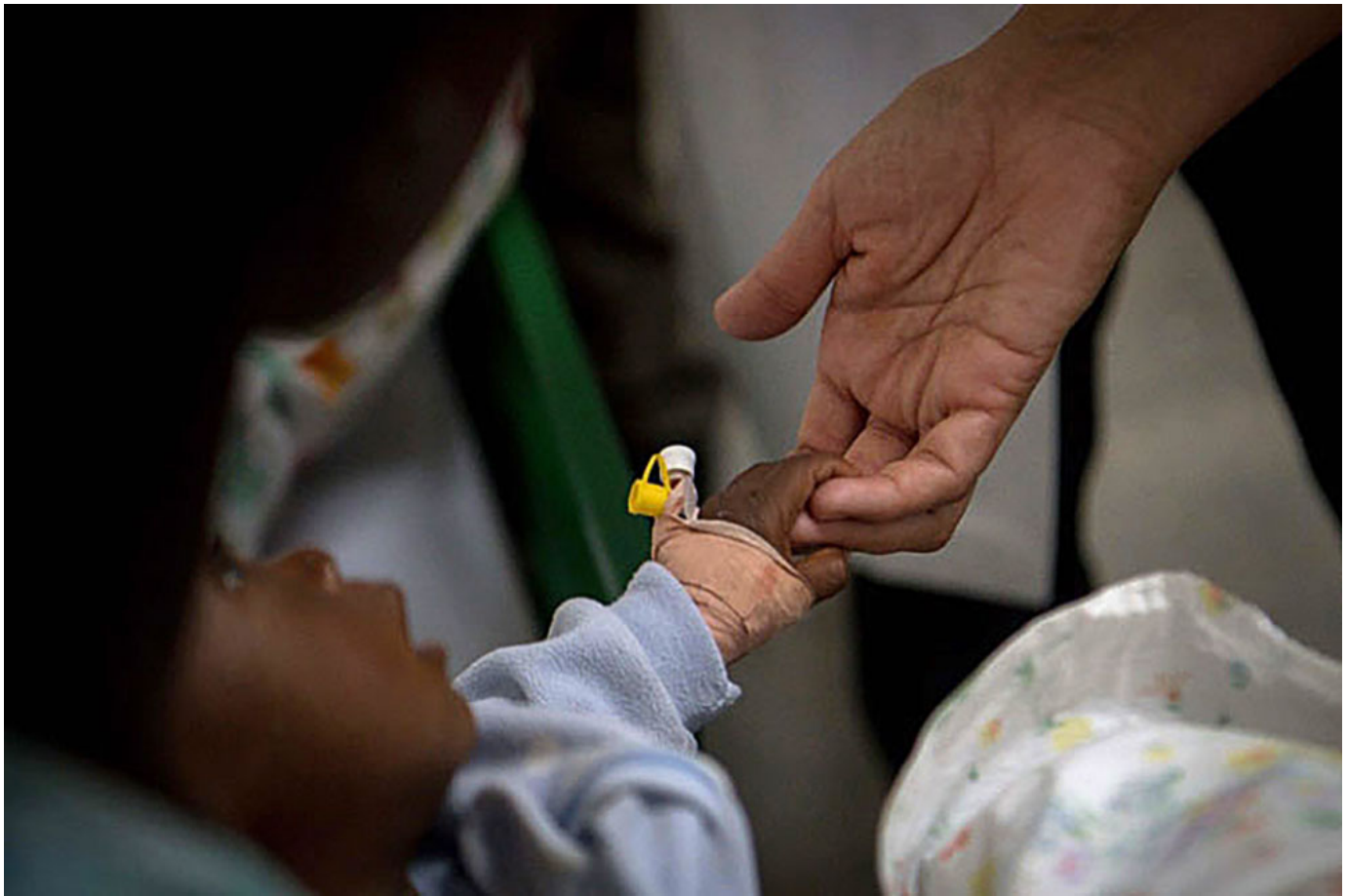
An Ursuline sister holds the hand of an infant patient in a cholera clinic in Verrettes, Haiti, in 2017.

Generally speaking, the diaconal works of women religious (medical clinics, food banks, educational initiatives) are largely self-funded. Hence, the UISG request strikes to the heart of the diaconal vocation and office in the church. It underscores the need for bishops and parishes to provide for the poor with diocesan resources, not replacing the many organizational works of women religious, but complementing them.