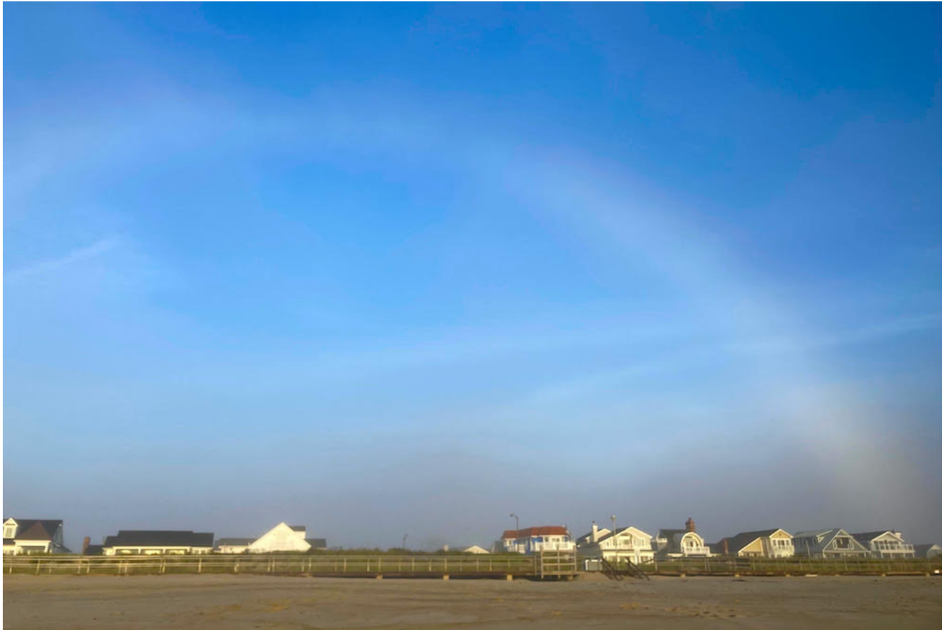
A fogbow over Spring Lake, New Jersey, November 2020 (Mary Bilderback)