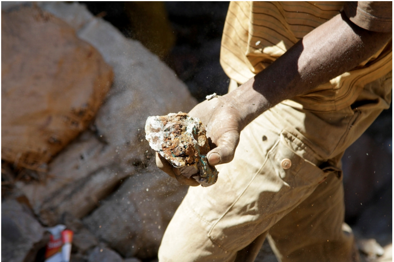
An artisanal miner carries raw ore near Kolwezi, Democratic Republic of Congo, Aug. 16, 2016.

"It has helped more than 3,000 children quit the mines and attend school, 500 families to secure alternative and sustainable livelihoods, 300 girls and women to gain new skills and make a decent living away from the mines, and educated more than 20,000 people on how to campaign for better working conditions," the congregation said.