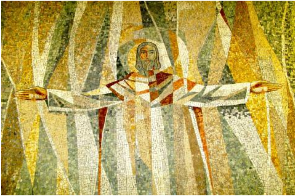
"The All-Embracing Love of the Resurrected Christ" mosaic

My companion and I have traveled three hours to join our friends who have reserved front row seats in the crowded chapel. We sit and rise and clap and cheer, one song after another.