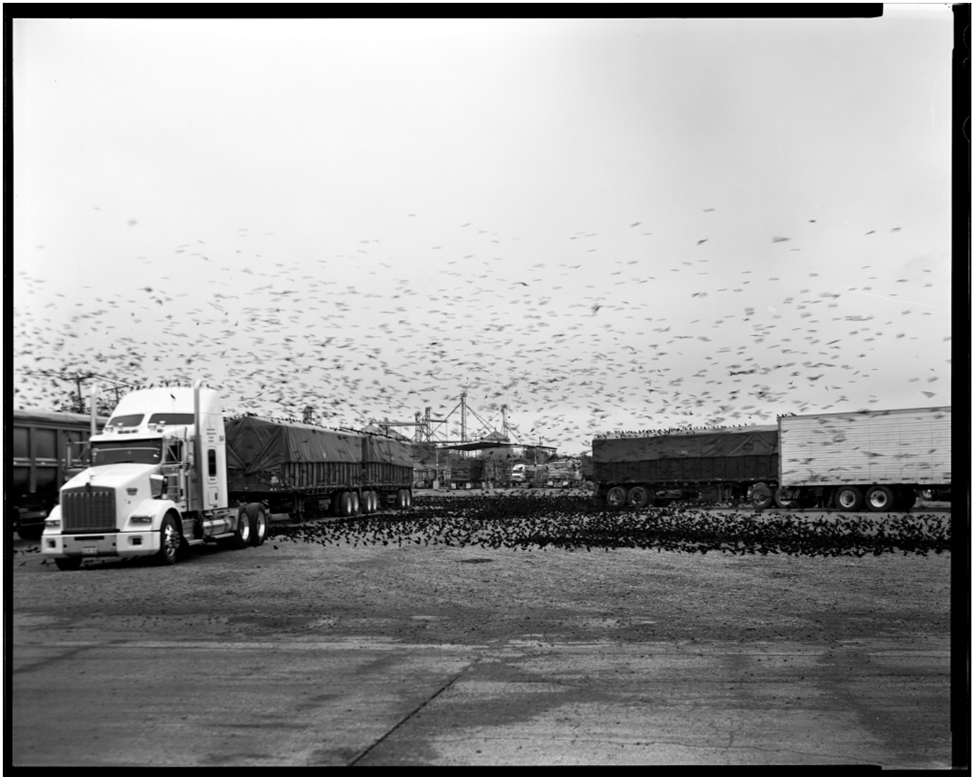
Red-winged blackbirds circle the spills of grain from a truck in Progreso Lakes, Texas. The scene, captured in January, was "Hitchcock-esque," Elmaleh says.