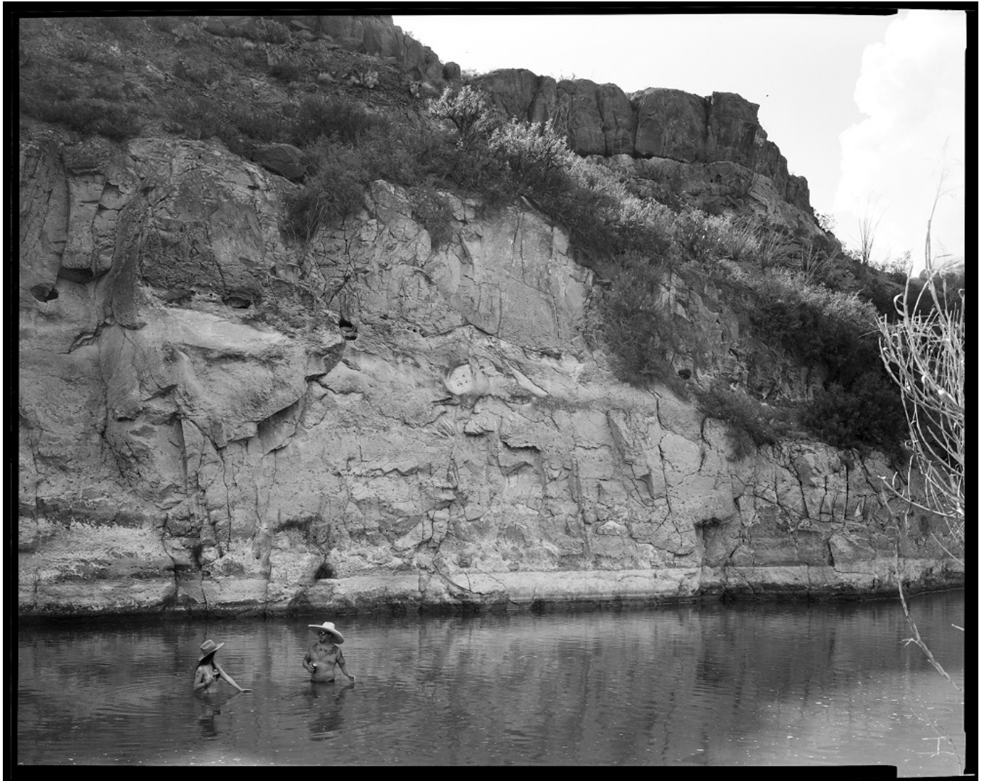
All along the Rio Grande, people enjoy the water and go for swims. Here are two individuals in Big Bend Ranch State Park; the cliff behind them is Mexico.