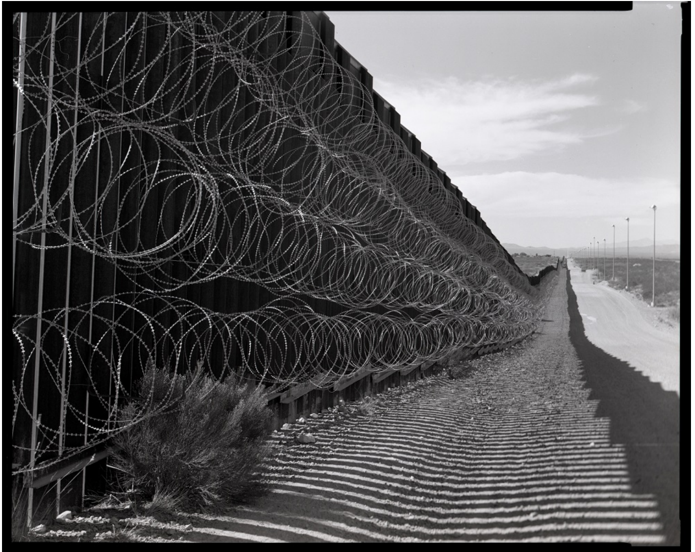
The border wall in Douglas, Arizona, in October 2020. The barbed wire is a typical feature on parts of the wall that border two cities, such as this one straddling Douglas and Agua Prieta, Mexico.