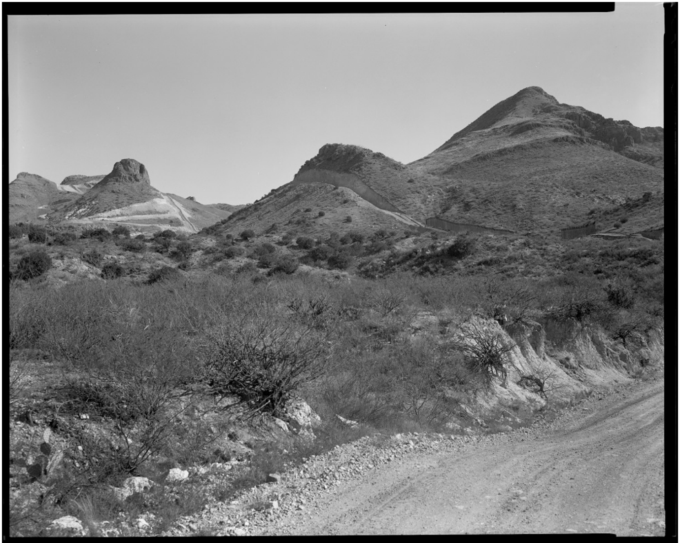
A portion of unfinished border wall is faintly visible at right against Guadalupe Canyon in Arizona, where a section of the landscape was intentionally cut down for wall construction. This photo was taken shortly before President Joe Biden's inauguration, when construction of the wall came to a halt.