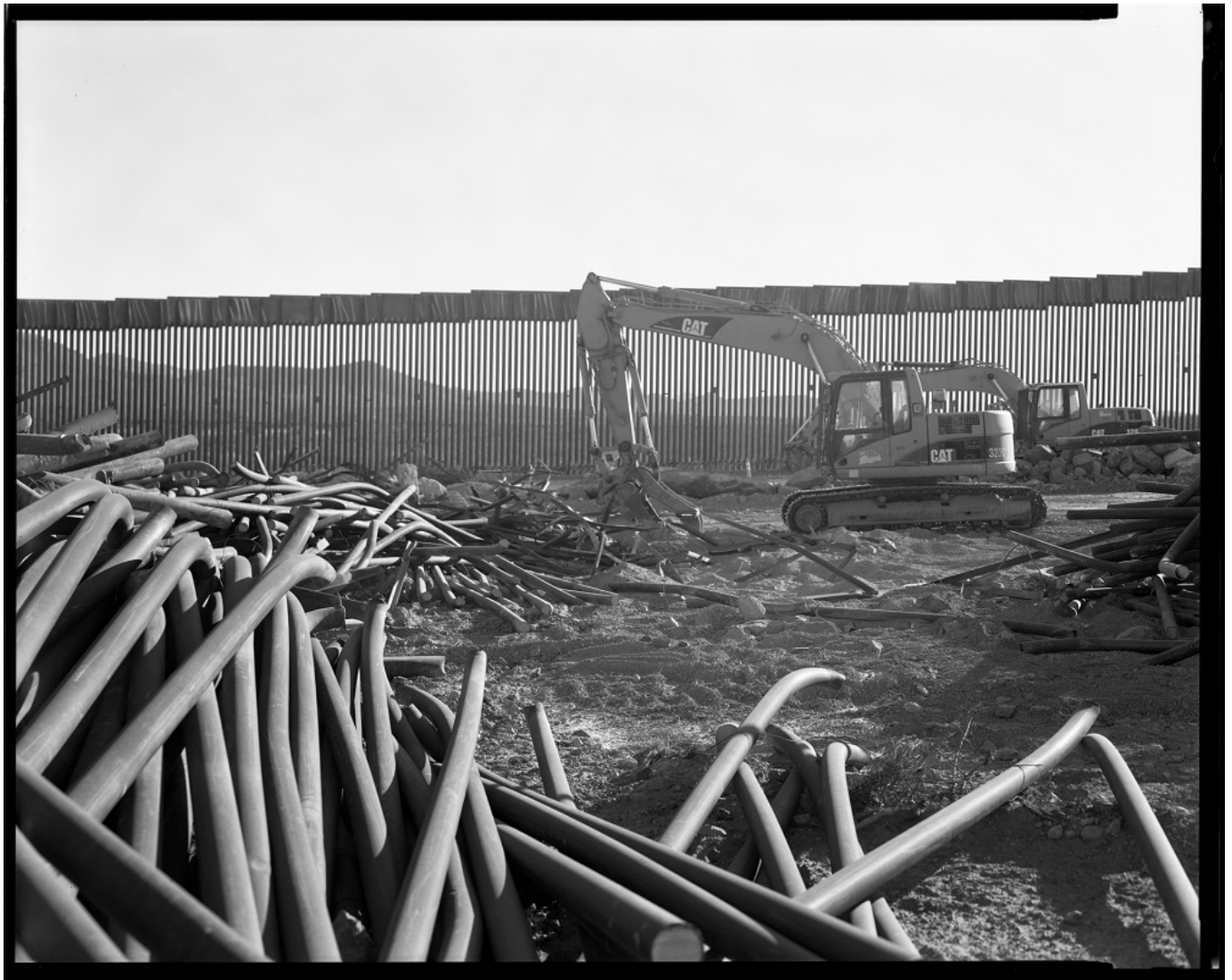
Outside Forrest, Arizona, in the last weeks of the Trump presidency, pieces of the old wall are thrown away as a new wall is built.