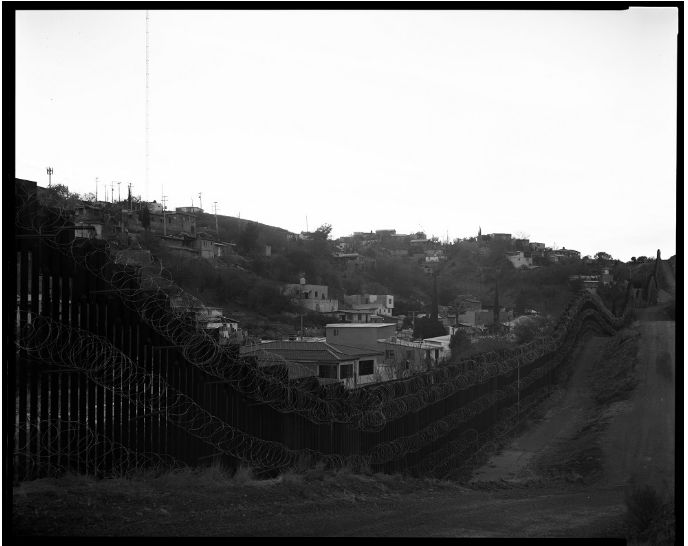
The community of Nogales, Mexico, as seen over the Arizona border fence in January. The city utilizes every inch of its side of the wall.