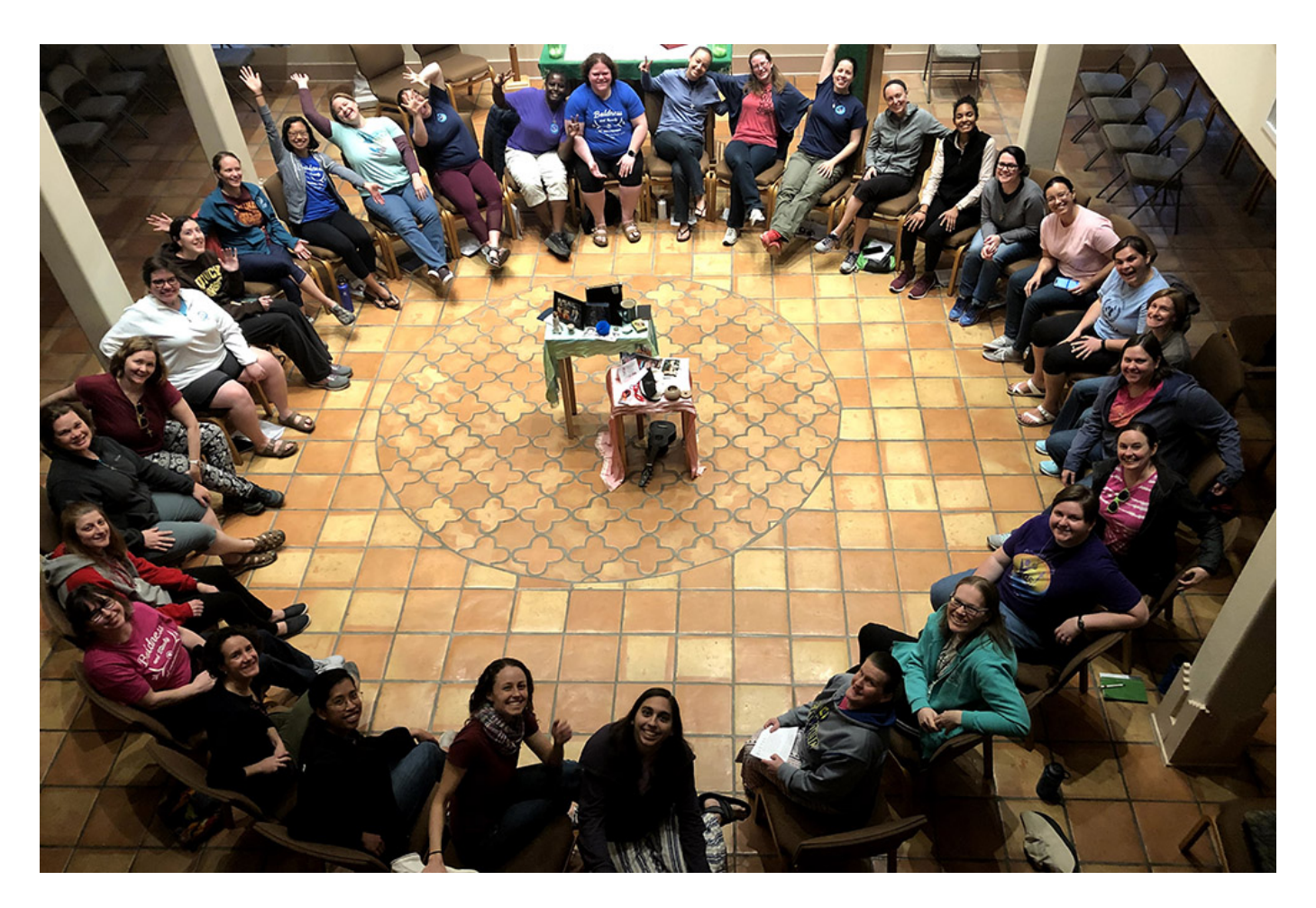
Young sisters are pictured at the Giving Voice retreat in Phoenix, Arizona.

That unanswered question followed me to the annual Giving Voice retreat in Arizona. In the monastery chapel I was met by the motherly gaze of no less than 26 images of Our Ladies of Guadalupe. I sat in our opening circle, one of 30 young sisters gathered for the weekend, and we began our time together by sharing the story of a meaningful object we had each brought. I listened to others share their symbols, why it was important, how it related to the theme, and how it spiritually connected them to God. Holding a pile of old greeting cards tied with a ribbon, my nerves tightened into little knots, but I knew that I could share something so personal to me with this circle of community.