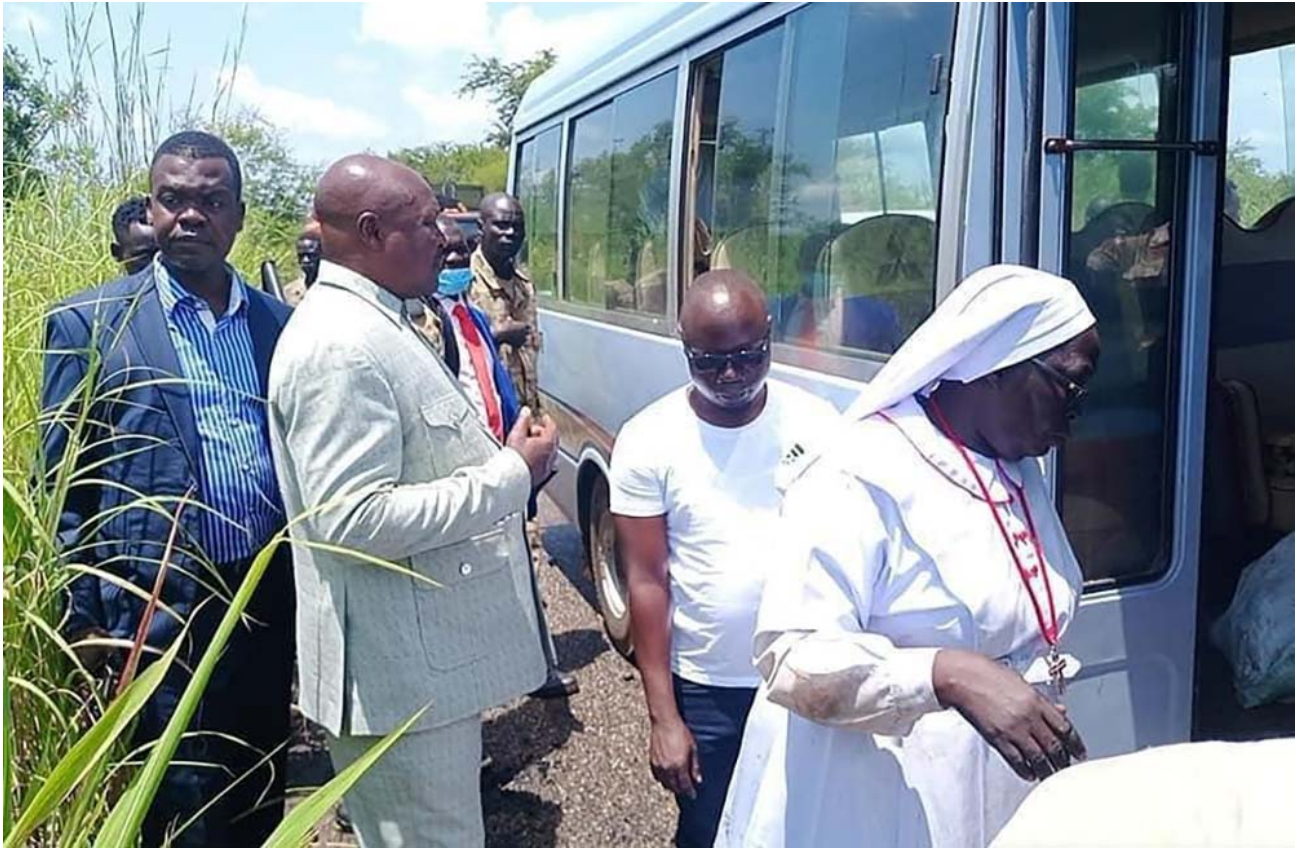
A sister boards the bus that was carrying seven sisters and five men from the Torit Diocese to the Juba Archdiocese in South Sudan after its ambush Aug. 16.