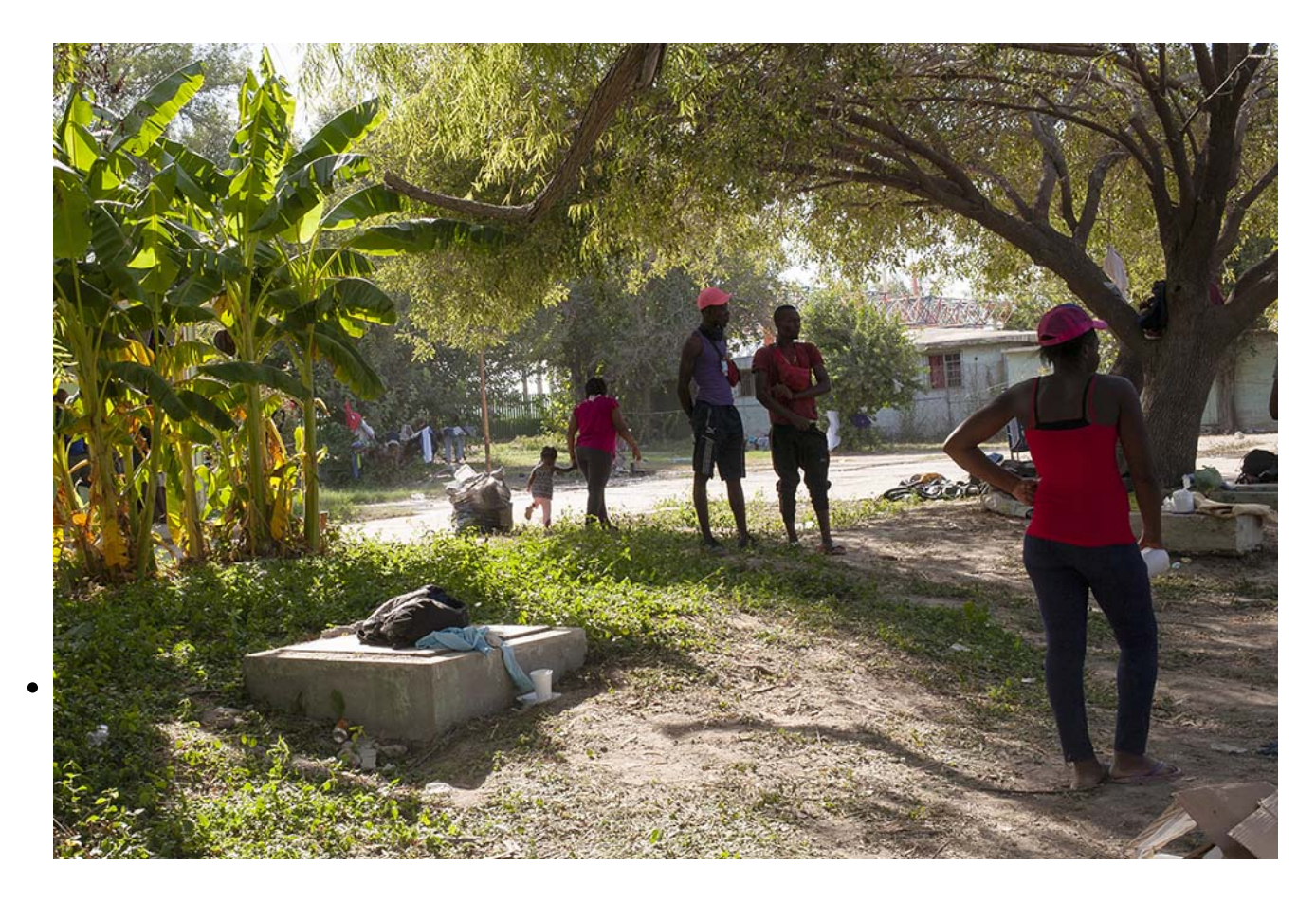
Haitians at an immigration camp Sept. 22 in Ciudad Acuña, Mexico, where they were sheltering after they arrived en masse.