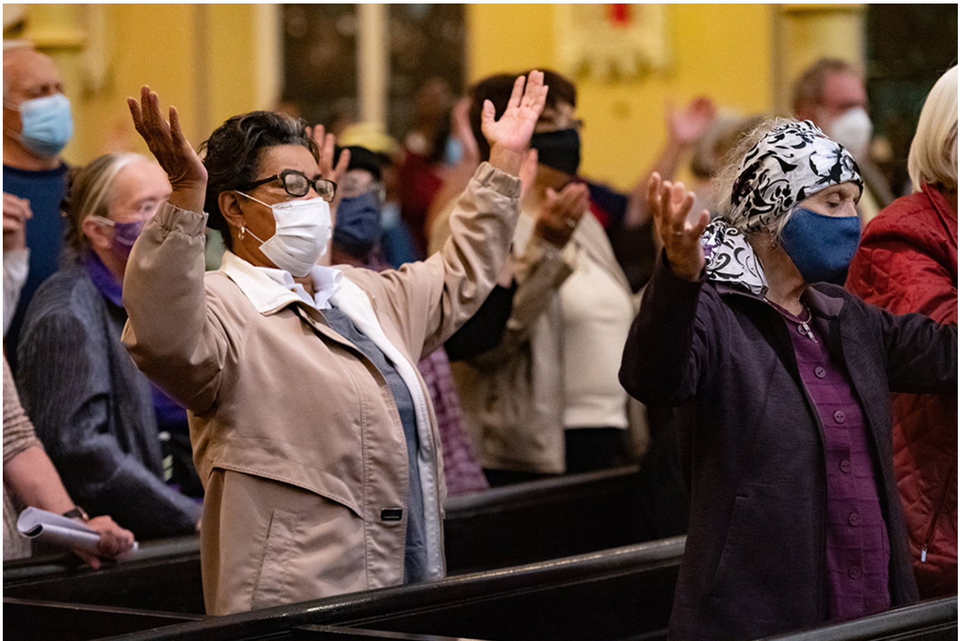
People in Baltimore attend All Saints' Day Mass at St. Ann Church Nov. 1.