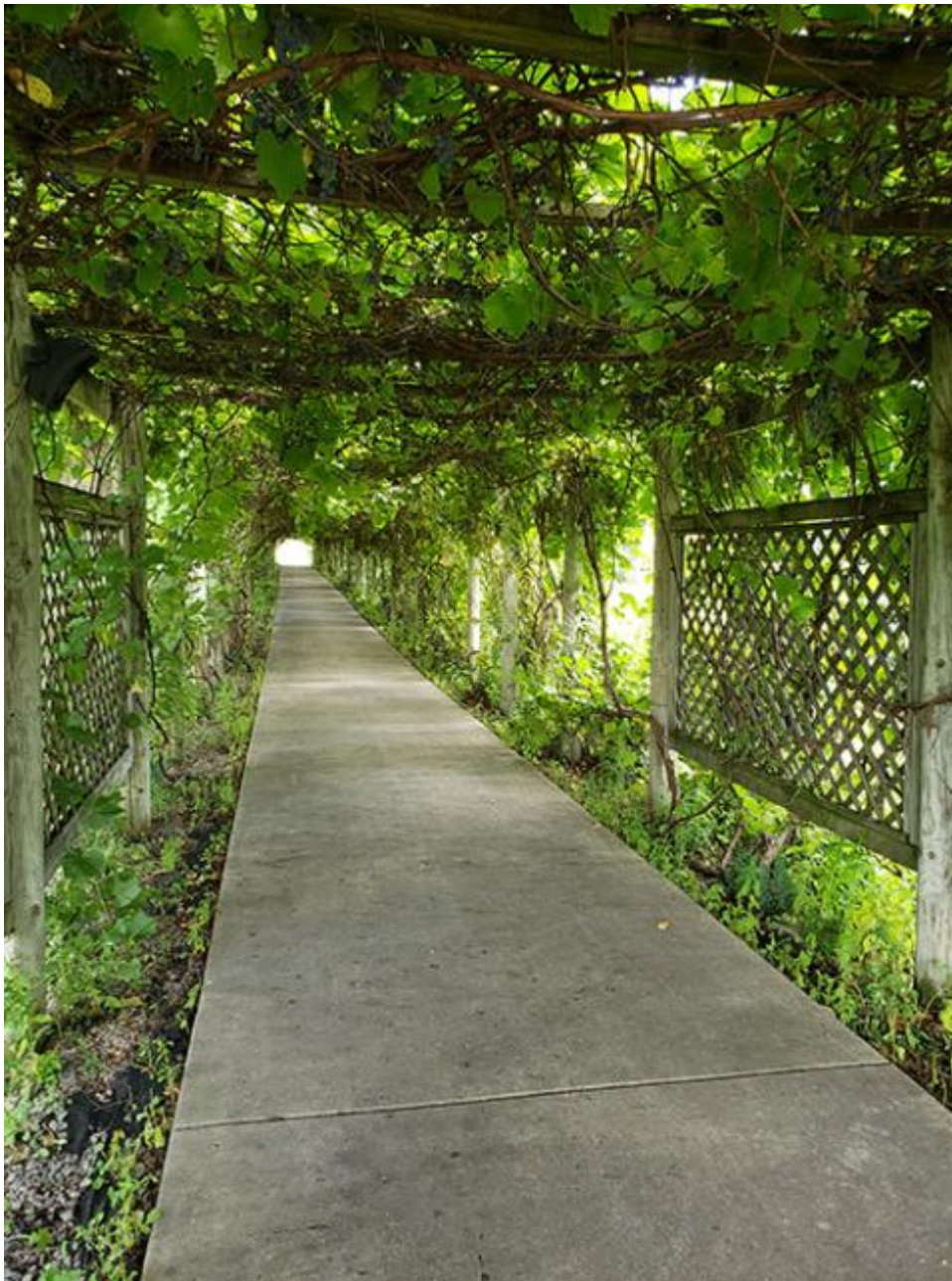
The grape arbor at Notre Dame of Elm Grove in Elm Grove, Wisconsin