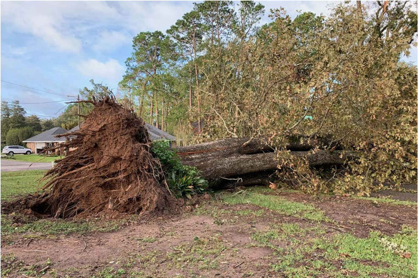
Uprooted oak tree after Hurricane Laura last year, Lafayette, Louisiana

The gradual lowering of the planet's dusky evening glow invites us to trust again in our waiting and hoping. We look into ourselves and open our hearts to the transition from wind-whipped trees to Jesse trees.