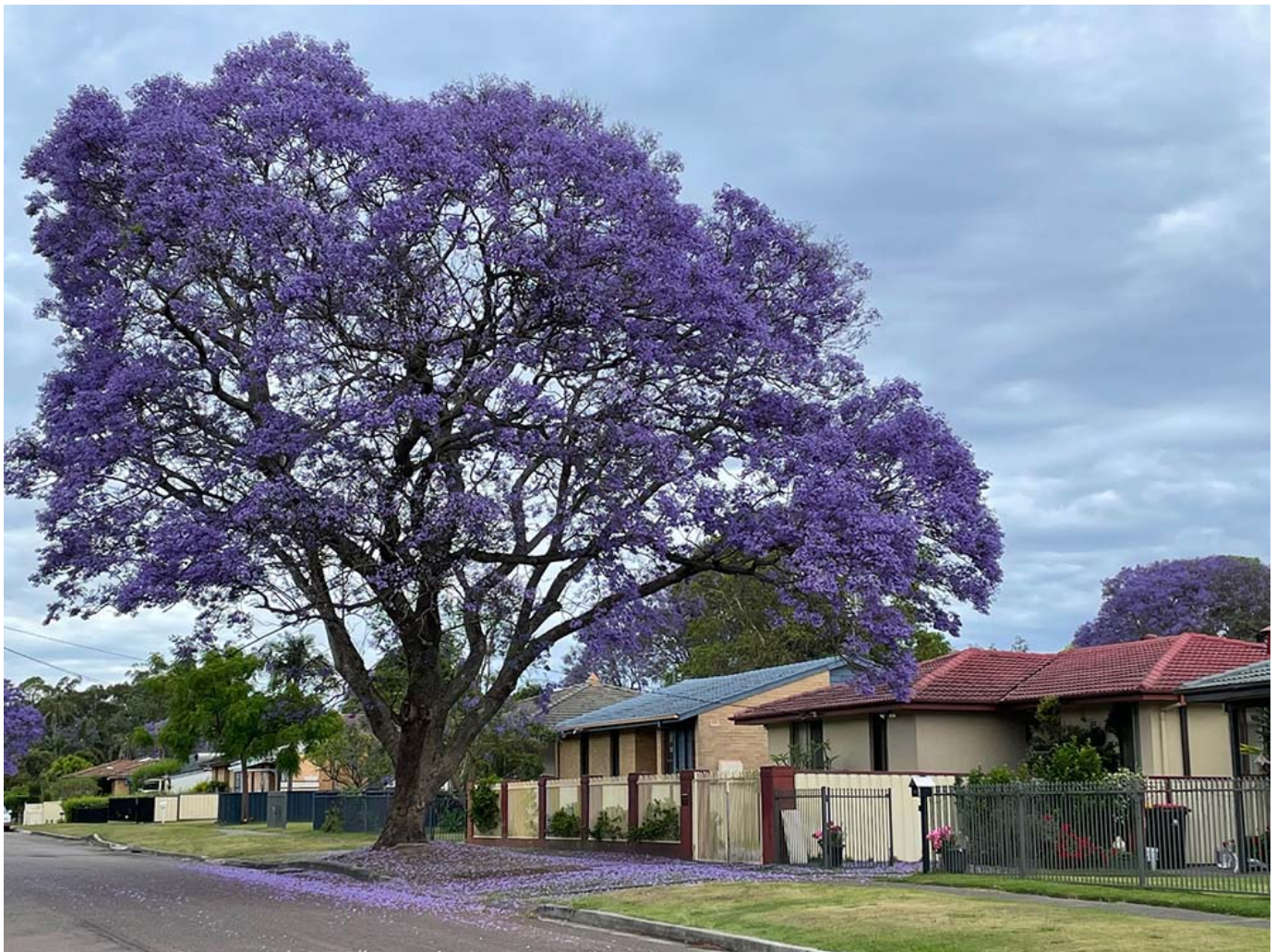
The jacaranda tree flaunts its Advent colors this time of year. (Tracey Edstein)