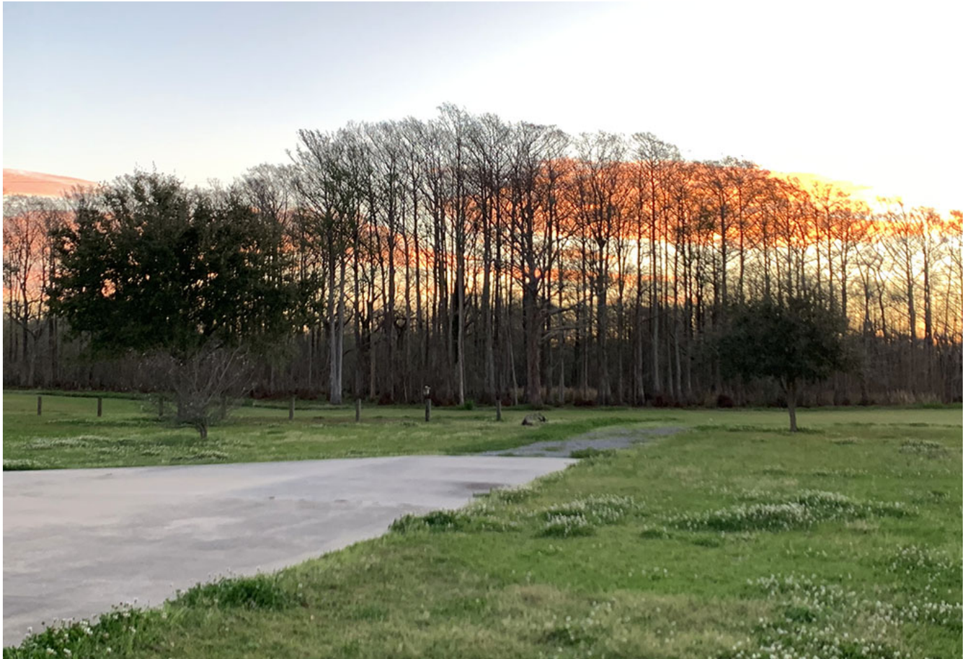
Lake Arthur, Louisiana, before it was devastated by Hurricane Laura

There are the other storms of this past year, no matter where one lives, that swept us at times into churning waters of discouragement and cynicism. At times, we have had to witness the moral failures of societal norms in the faces of war, natural disasters and the pandemic. We are doused in downpours of tweets and insta-everything to the point where we lose our own rootedness.