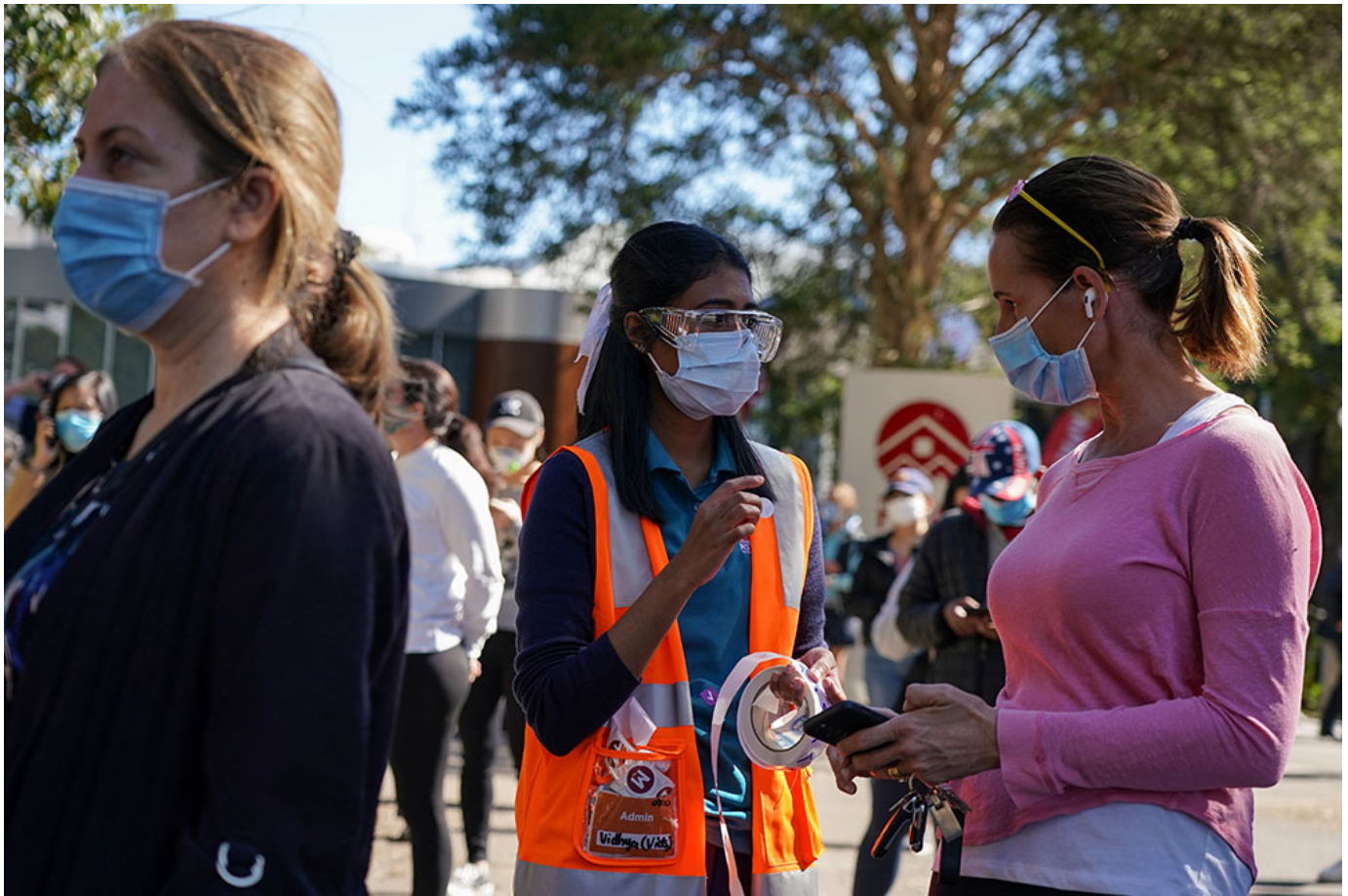
A staff member assists people waiting in line outside a COVID-19 vaccination center at Sydney Olympic Park during a lockdown to curb the spread of an outbreak in Sydney Aug. 16.

These COVID-19 lockdown times, while tedious and challenging, have given us many gifts, new opportunities, and discoveries — a bit like the ingenuity a mum has in finding ways to keep kids entertained on long car trips. Our sisters have learned to connect so well online and there has probably been more time in lockdowns to focus energy on some of the critical issues facing us — locally and globally.