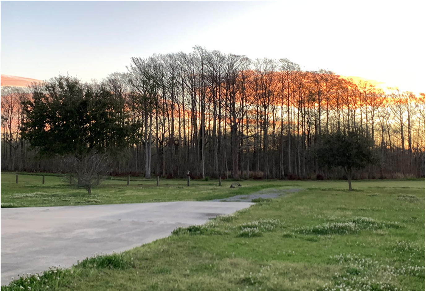
Lake Arthur, Louisiana, before it was devastated by Hurricane Laura

There are the other storms of this past year, no matter where one lives, that swept us at times into churning waters of discouragement and cynicism. At times, we have had to witness the moral failures of societal norms in the faces of war, natural disasters and the pandemic. We are doused in downpours of tweets and insta-everything to the point where we lose our own rootedness.