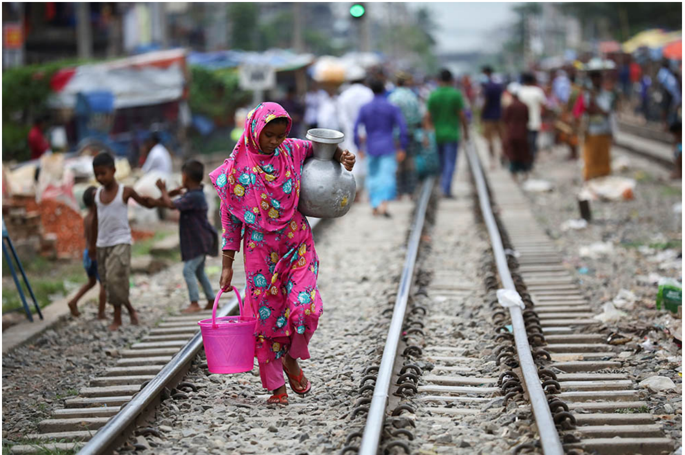
A woman carries drinking water along railroad tracks in a poor section of Dhaka, Bangladesh, Sept. 15, 2020.

The Province Leadership Team, of which I am a member, recently visited our sisters working in the Dinajpur Diocese in northwest Bangladesh. Our mission there is in a very remote area, and the people there are among the poorest in the diocese. The Catholics are converts from a very low caste of Hindu people. They are deprived and discriminated against in every way: socially, economically, in educational opportunities, and even in moral formation. They are marginalized in their own society as well as in the church.