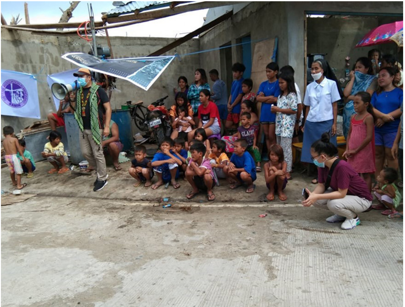
Children and a few adults wait for their parents and relatives who are in line to receive relief goods in one of the distribution areas along a coastal community in Surigao City.