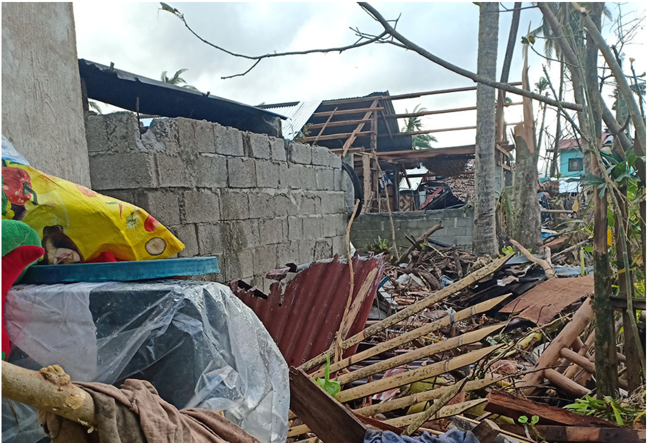
Debris from houses and fallen trees in San Francisco, Southern Leyte.

They immediately left the town to return to Mindanao to prepare for other missions, she said, but had to wait for 20 hours at the port to get a ferry back.