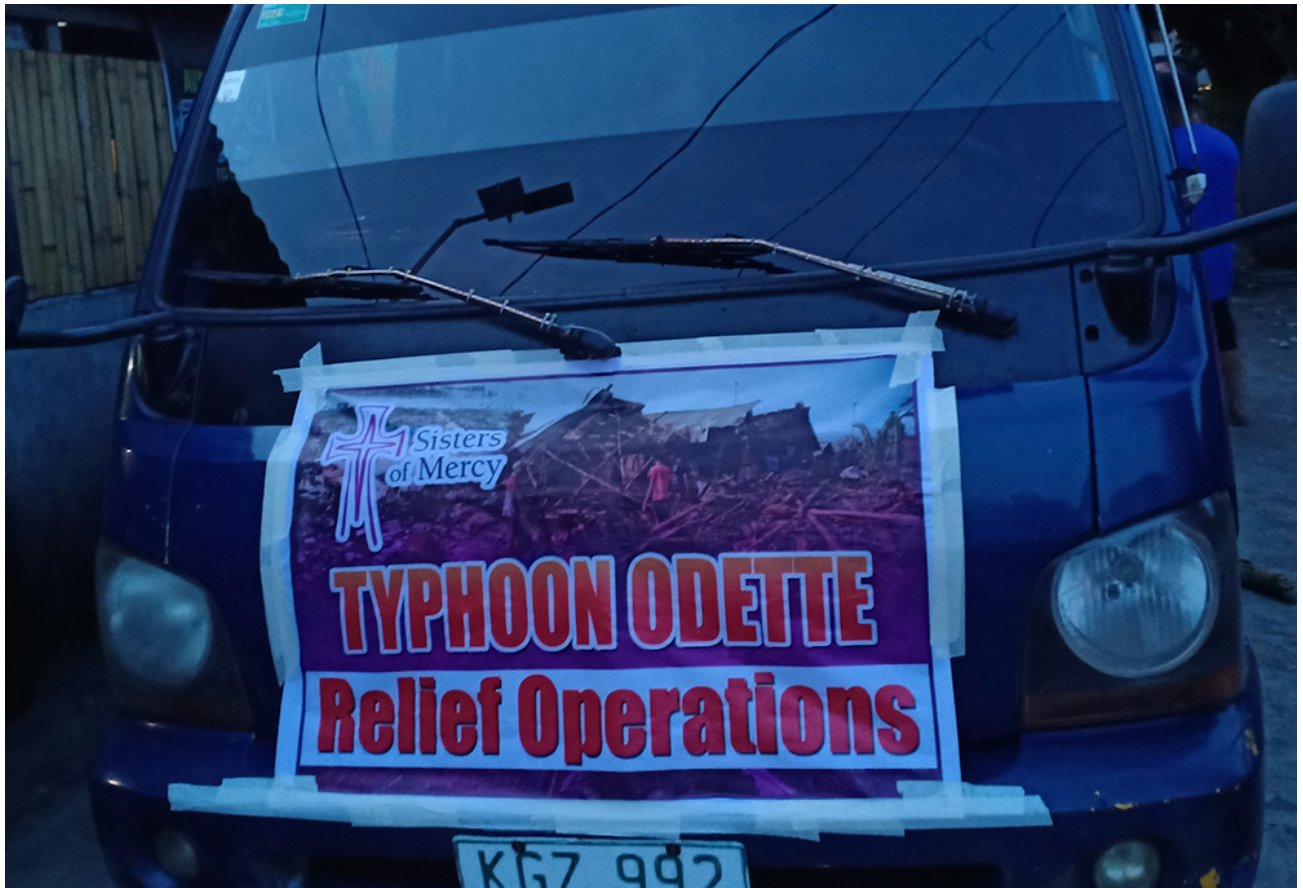
One of the vehicles the Mercy Sisters from Mindanao used to carry the relief goods they brought to Southern Leyte in the Visayas.