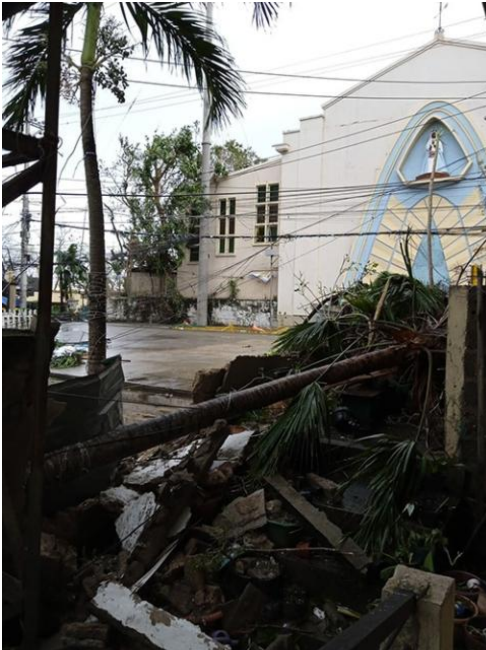
Fallen trees on top of the rubble of the gate of the convent of the Missionary Sisters of Mary in Lapu-Lapu City, Cebu province.

On Dec. 20, five Mercy sisters traveled nearly more than 300 miles (more than 480 kilometers) from northern Mindanao Island to a town on Leyte Island to provide aid to 300 families affected by the typhoon. A Mercy sister is from that town and her family reached out to the congregation after the typhoon hit asking them to help the community.