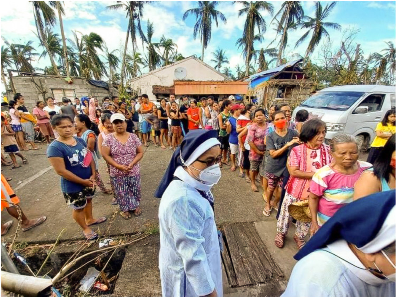
A Mercy sister oversees the distribution of relief goods in San Francisco, Southern Leyte.