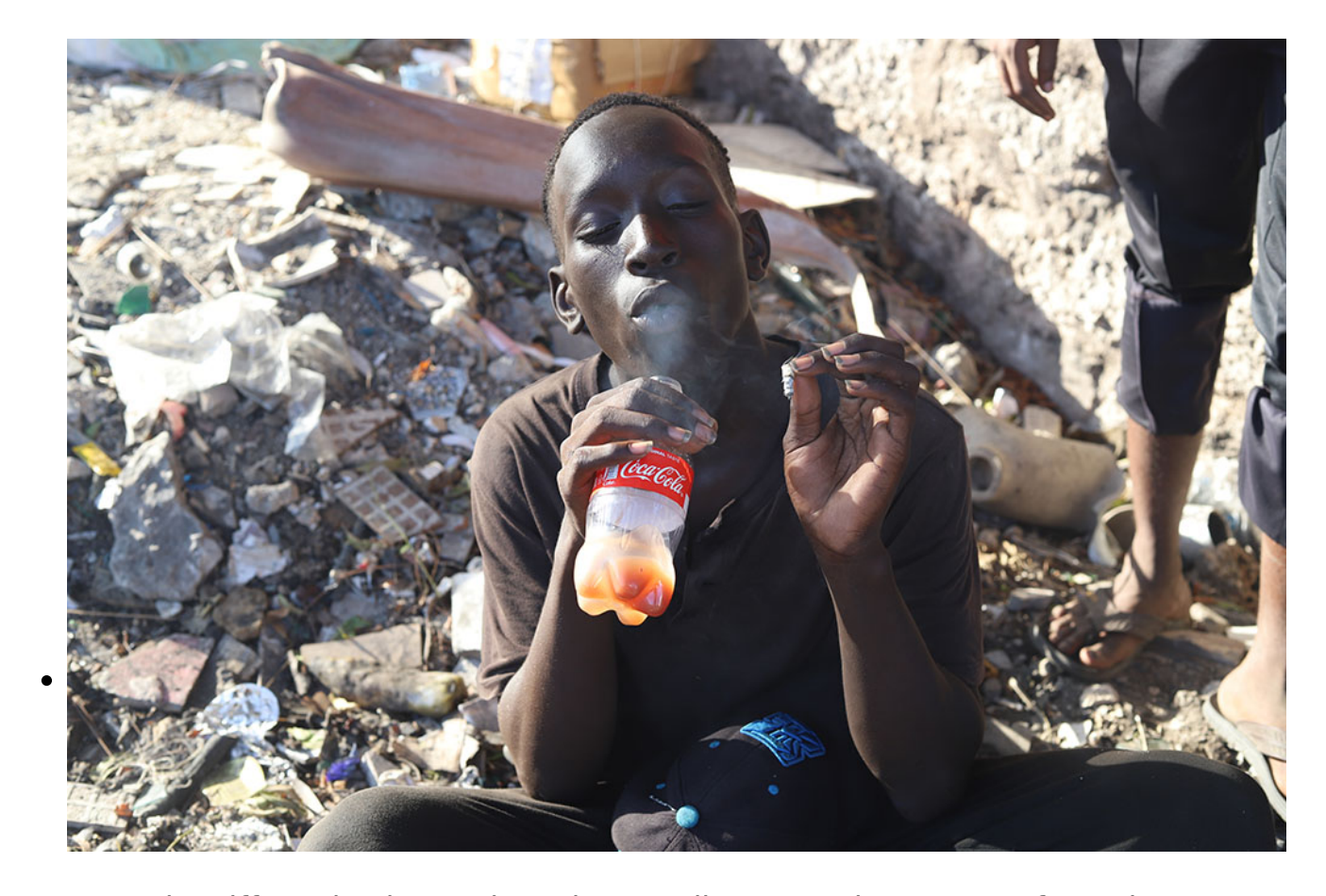
A youth sniffs toxic glue and smokes marijuana on the streets of Mombasa, Kenya.