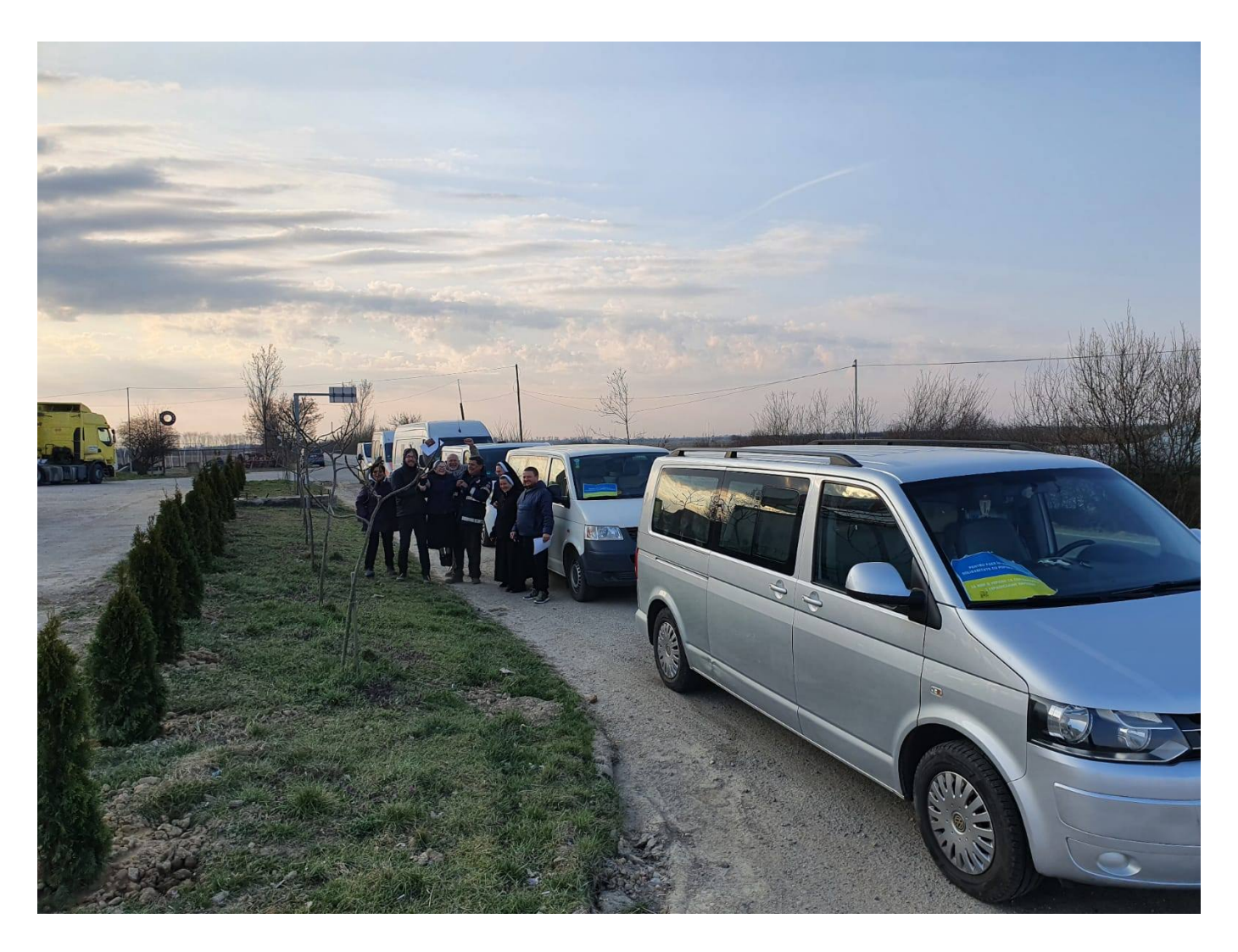
Sisters from the Romanian congregation of St. Basil the Great bringing goods to the congregation in Mukachevo on March 29.