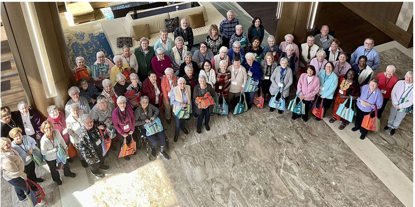
The Sisters of Saint Joseph of Peace at their 2022 chapter

The reset is to know who we are and whose we are.