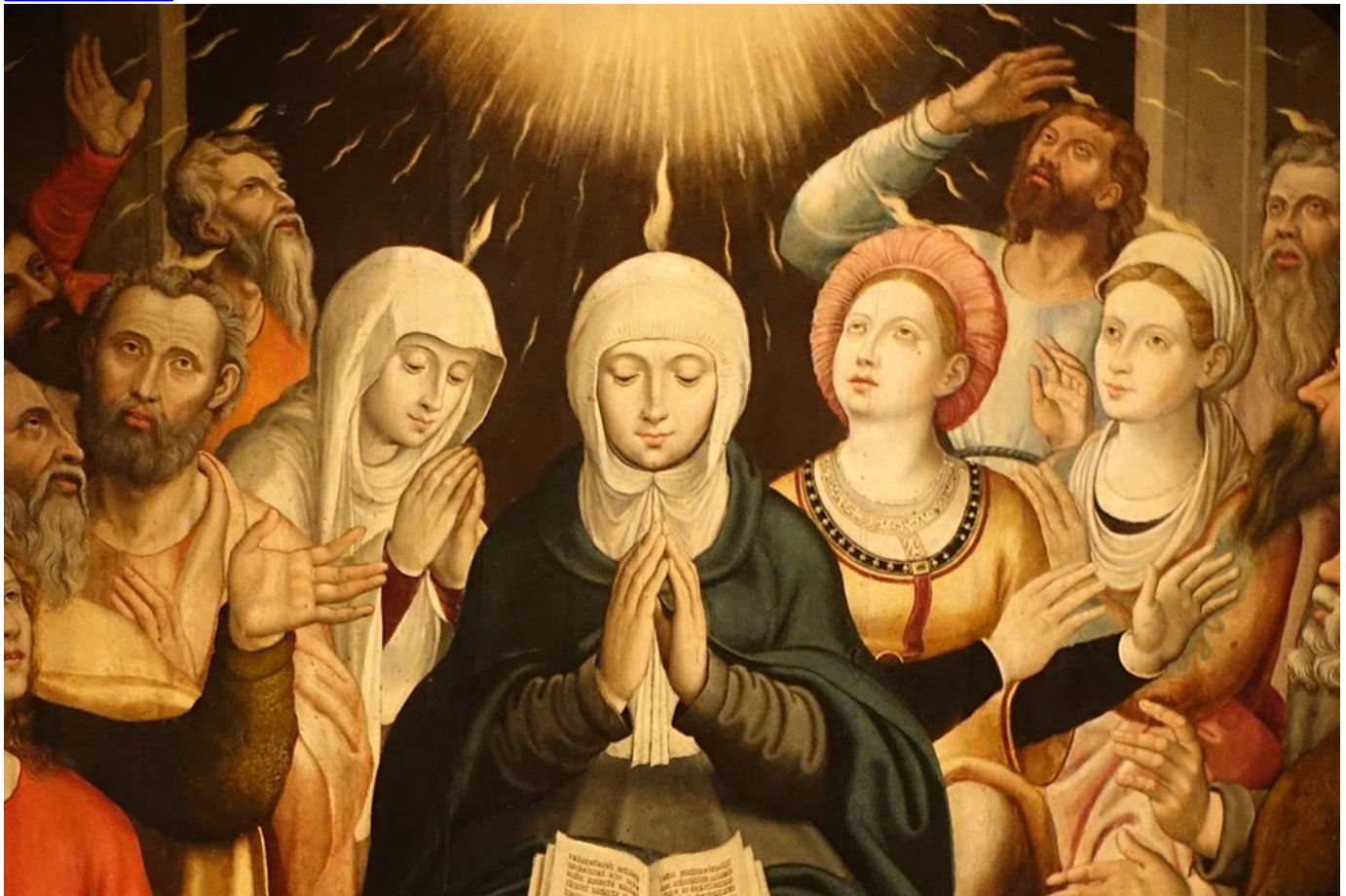
"Pentecost" (detail) by an unknown 16th-century painter in Portugal