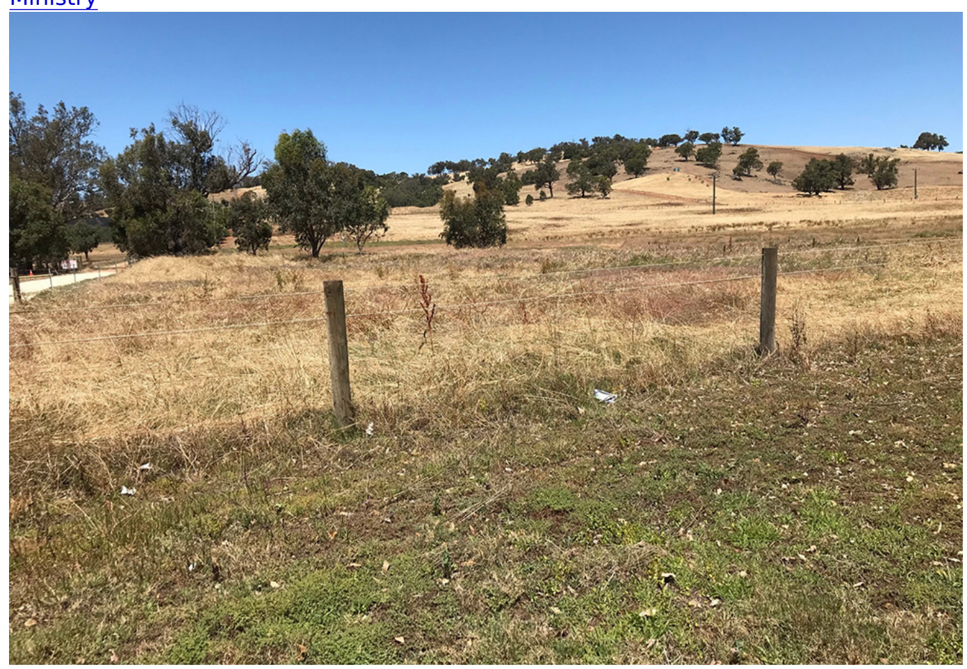
A dry flat area in Western Australia (Frances Hayes)