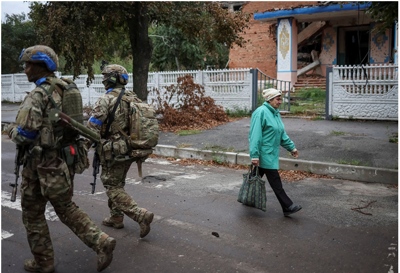
A woman passes Ukrainian servicemen patrolling an area Sept. 14 in Iziurm.

Add the war in Ukraine, and "it's compounding crises, one after another, and the resilience of the people is eroded, basically. They cannot cope anymore. I mean, you are a family, a woman farming in the dry corridor of Honduras, and you got the [2020] Eta hurricane," she said. "On top, you got COVID-19, where you couldn't plant or couldn't move your harvest. And then you get that everything you buy is double in price."