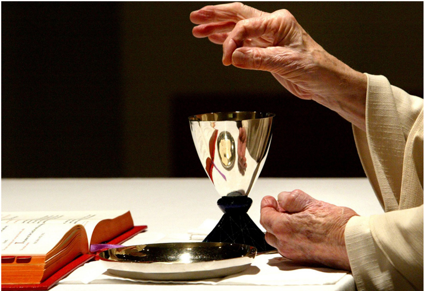
A Trappist priest mixes the consecrated bread and wine during Mass in a May 2006 file photo at Holy Cross Abbey in Berryville, Virginia.

One of the most important differences about making a retreat at a monastery is joining the monks or the nuns for the Divine Office (Liturgy of the Hours) and the celebration of Mass. Everything at a monastery is at a much slower pace than I am used to experiencing — especially in the way they pray. Retreatants are invited to lauds, midday prayer, vespers and compline (and vigils at 3:30 a.m.!) with the monks.