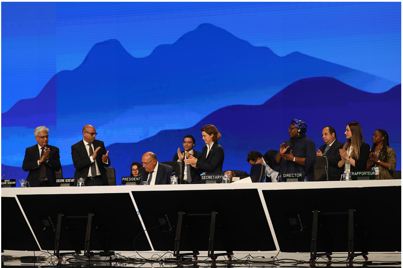
The closing plenary of COP27 in Sharm el-Sheikh, Egypt, Nov. 20

"My worry is that many things have been agreed on before but have never been implemented," said Munene, who called on world leaders to now move to implement the loss-and-damage fund.