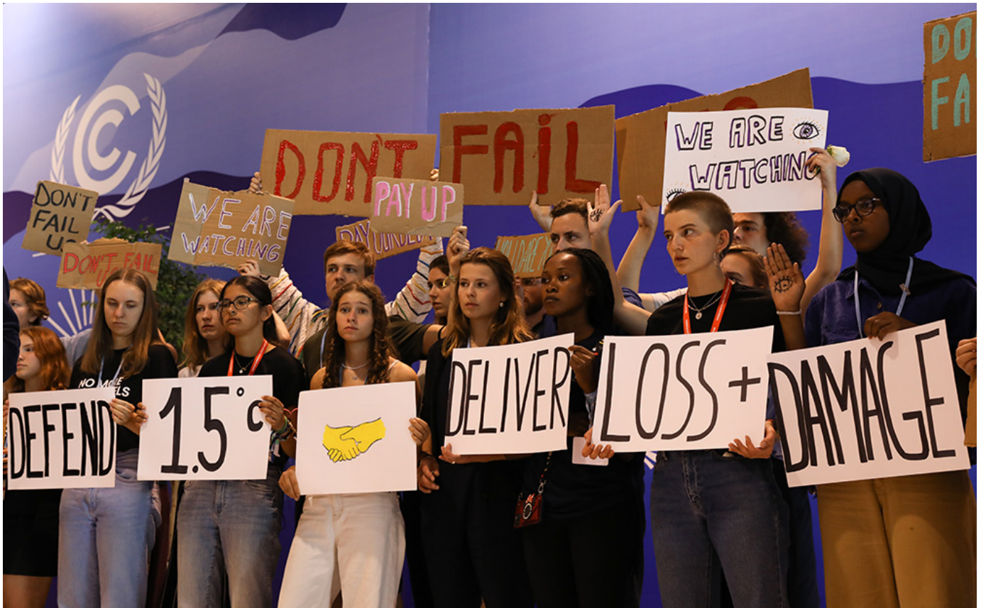
Young activists demonstrate at COP27 in Sharm el-Sheikh, Egypt, Nov. 19.

"We emphasize that any implementation of climate solutions must be anchored on the following three pillars: justice, equity, and solidarity," the statement said.