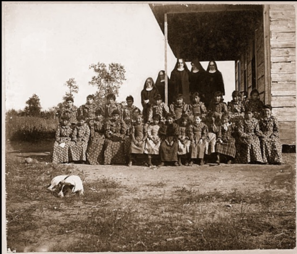
Sisters and students at Red Lake Indian school 1889

In 2022, the U.S. Department of the Interior released an initial report on the nation's boarding schools that included a list that government researchers compiled based mostly on funding reports to Congress. That list excludes the system's many day schools, and though religious organizations supported or ran about half of the boarding schools listed, most of those associations are vague or unclear.