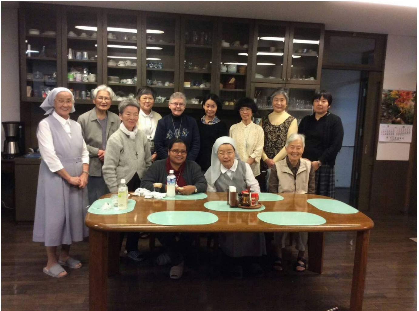
Sisters of the Congregation of Notre Dame in the community of Tobata, Kokura, Japan

I think this is due to the fact that, in terms of community life, the sense of harmony is crucial, and this is very clearly felt here. Even though the sisters may have differences among themselves, which is a normal part of the challenges of living together in a community, they have an admirable sense of hospitality, respect for the person, and attention to the needs of all in the community.