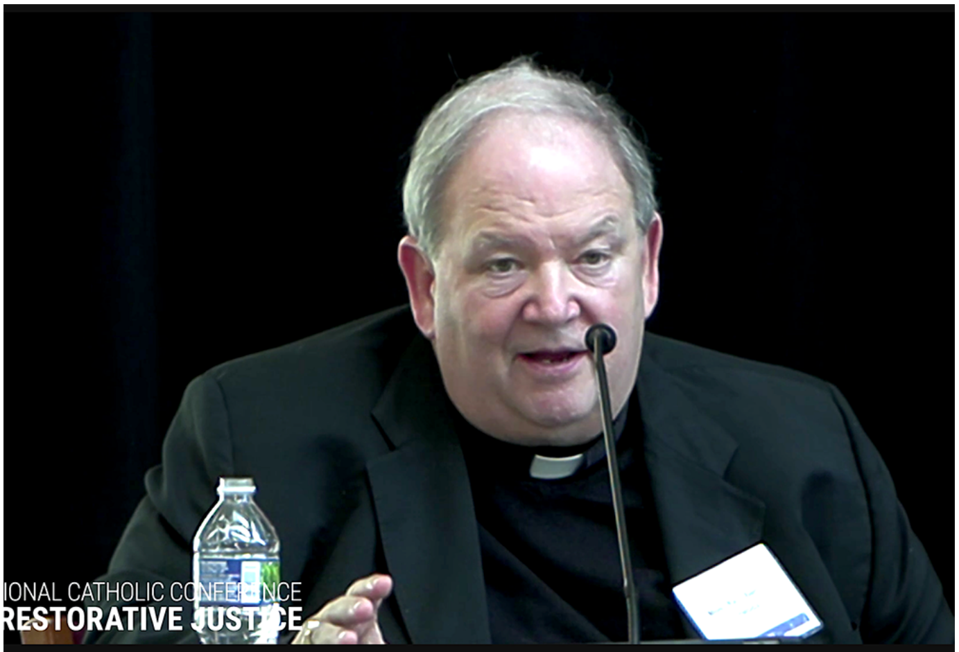
Archbishop Bernard Hebda of St. Paul and Minneapolis speaks Oct. 6 at the National Catholic Conference on Restorative Justice in Minneapolis. (NCR screenshot)

But truly listening to survivors can bring transformation.