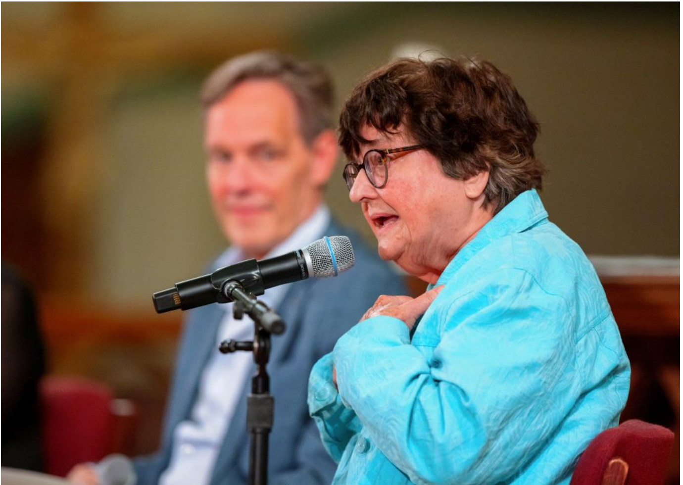
Composer Jake Heggie, left, and Sr. Helen Prejean speak at a Sept. 22 event on the opera "Dead Man Walking," sponsored by the Fordham Center on Religion and Culture and held at St. Paul the Apostle Church in Manhattan.

"It was and is a deeply human, timely and timeless story that is deeply American but also very universal," said Heggie, whose Presbyterian family attended church only at Christmas and Easter.