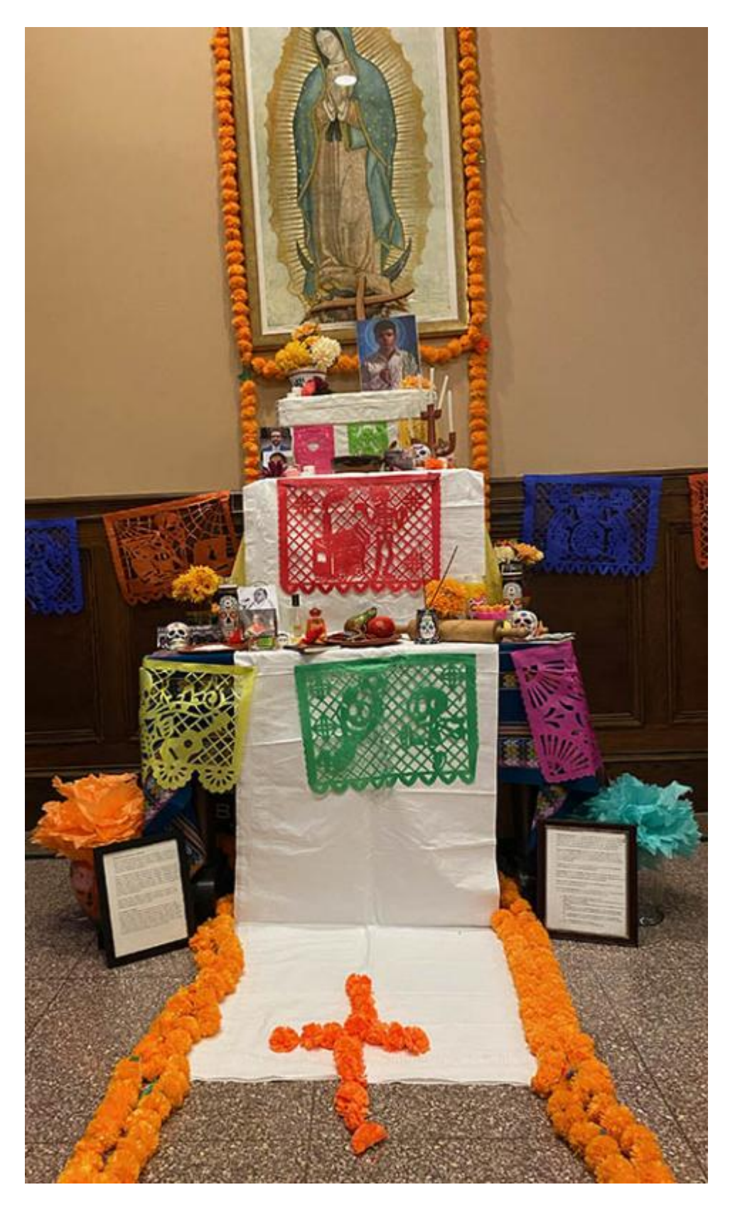
A Day of the Dead altar at Boston College, November 2023