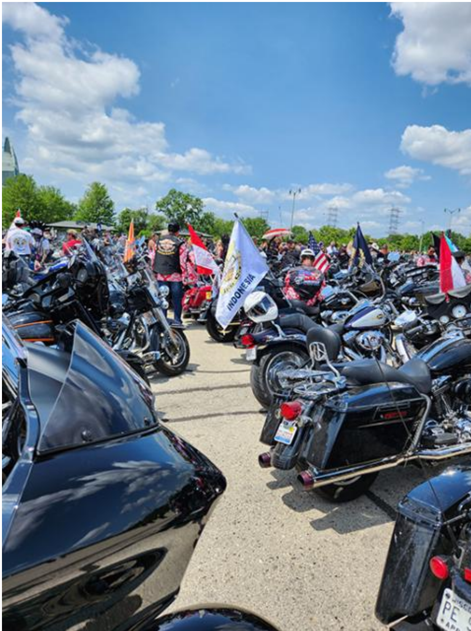
Staging area for the Harley-Davidson 120th anniversary parade, July 2023 in Milwaukee

The anniversary celebration ended with a parade through town. Thousands of bikes from around the world participated. On a whim, I went to the staging area for the parade, and discovered spectators could walk around and look at the bikes and chat with the drivers while the cue lines formed (Note: from first to last, it took two hours to clear the staging area and get everyone onto the parade route). Seeing flags from around the world and bikers communicating across cultural and language barriers was a prayer experience, a celebration of our global existence when gathered