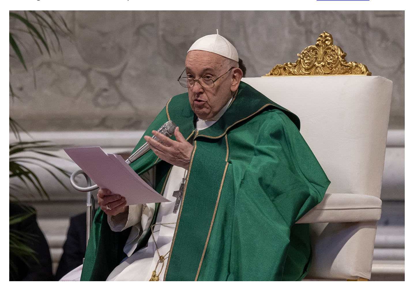
Pope Francis gives his homily during Mass for the World Day of the Poor in St. Peter's Basilica Nov. 19, 2023, at the Vatican.

According to the <u>The Washington Post</u> of June, 29th, 2023, over 238,000 people died in global conflict in 2022. This was among the highest in recent years. Conflicts and wars have continued to be recorded, with the latest being in the Holy Land. By the end of November 2023, <u>over 14,000 people</u> had been killed. With such a bleak reality, is it possible to conceive a world where peace reigns? The answer is yes. Scripture reminds us that the birth of Christ, the Prince of Peace, brings hope for a better world. Like the angels announcing his birth, we too can sing "Glory to God in the highest and on earth peace to those on whom his favor rests" (Luke 2:14).