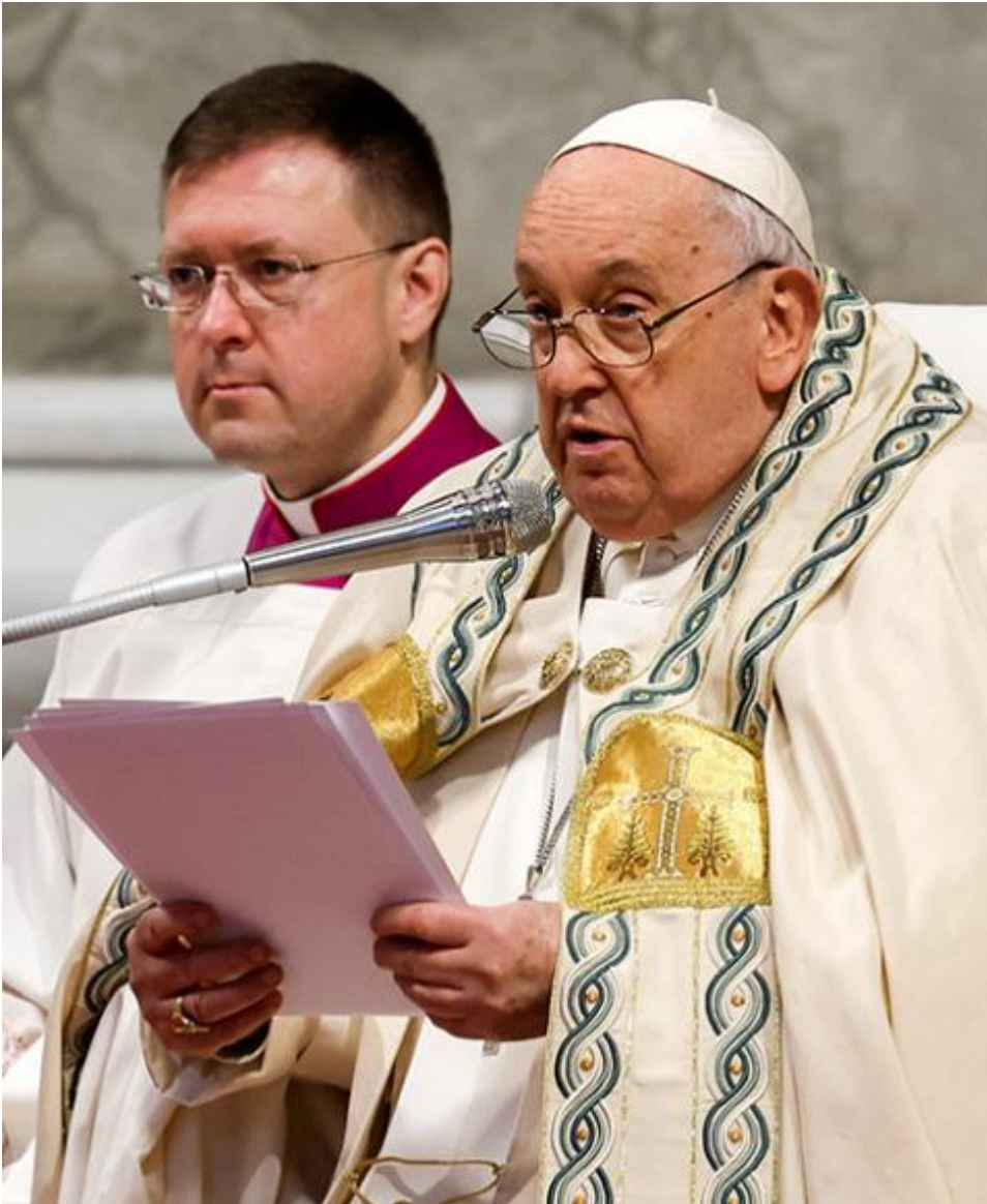
Pope Francis gives his homily during Mass for the feast of Mary, Mother of God, and World Peace Day in St. Peter's Basilica at the Vatican Jan. 1.

This year's theme focused on artificial intelligence and peace. Pope Francis, in a message , said, "The remarkable advances in new information technologies, particularly in the digital sphere, thus offer exciting opportunities and grave risks, with serious implications for the pursuit of justice and harmony among peoples."