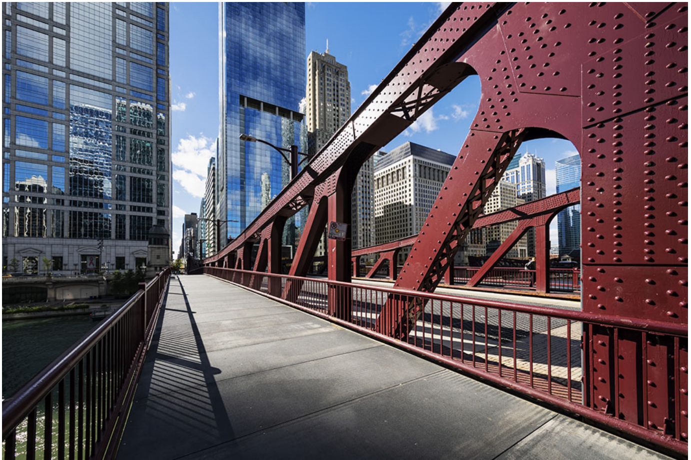
Downtown Chicago

"As we look at our current and emerging realities, it is vital for those who will be living this future to have conversations about what is needed now to help move into the future," an announcement said.