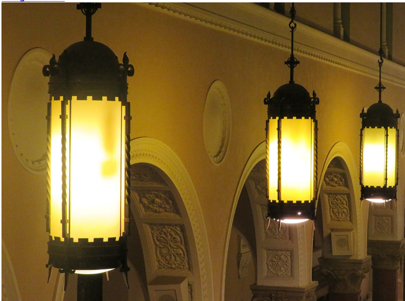
Wrought iron lanterns at St. Scholastica chapel, built in 1939 at Mount St. Scholastica Monastery in Atchison, Kansas (Helga Leija)