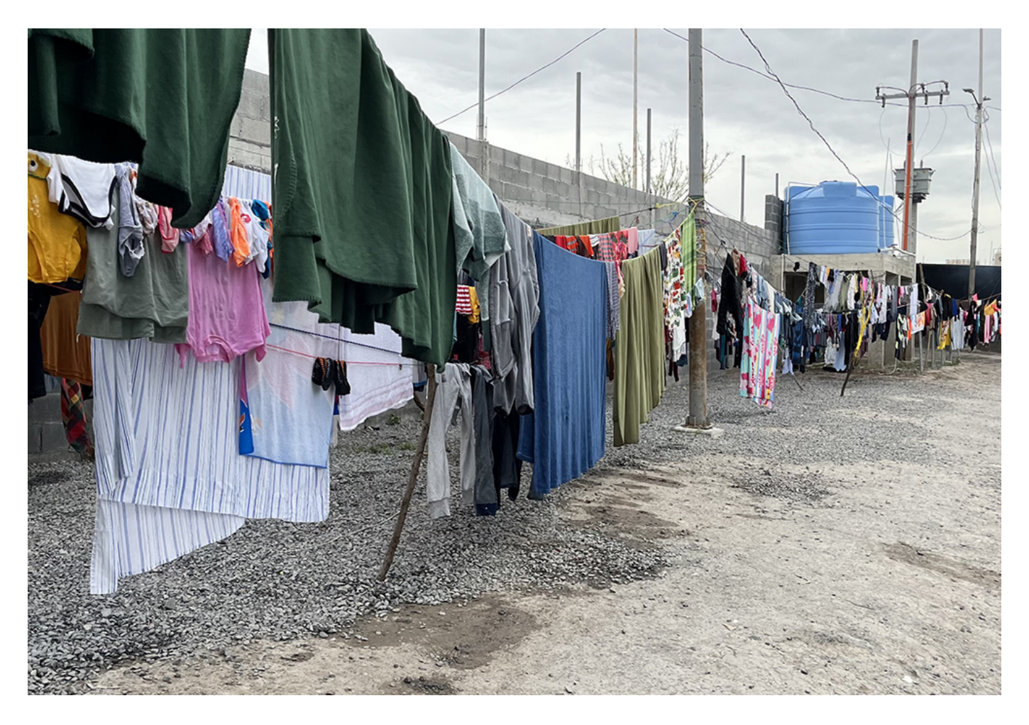
The migrant camp Senda de Vida 2 in Reynosa, Mexico

As I waited and was present to these people waiting, I felt a space opening within me. I wondered, could I do it? Could I be patient and compliant, waiting with hundreds of others in cramped quarters with my family for days on end? Could I sleep in either dormitory-type areas or in tents sandwiched in night after night? Could I handle the extremes of Texas/Mexico weather with the few clothes I would have carried? Could I keep my children happy and hopeful as they spend each day playing in a cramped space with limited access to toys and activities? Could I handle the memories of what I left behind — a job, a house, relatives, friends? Could I trust again after being betrayed by coyotes or others who took the little I had left to start a new life?